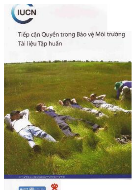
Training manual on the human-rights based approach to environmental protection

the delivery of the curriculum (through co-authorship), the project grantee aspired to increase support and demand for civil society participation among senior government officials and thus to improve the enabling environment for local environmental NGOs.