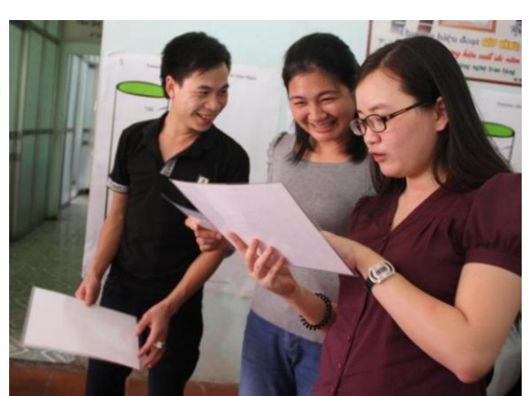
Participants of the Media Training on Sustainable Forest Management, which was supported by implementing partner CIFOR

from across a variety of disciplines has started to make use of the manual, as and when appropriate. However, evaluators have noted that the grantee (upon UNDEF recommendation) during the project's extension period organized two additional workshops to provide local NGOs with the opportunity to demonstrate the practical benefits of their environmental protection work to 88 officials (representing different levels of governance similar to the groups of participants above) and to directly discuss with them the barriers they face when trying to support civil society participation.