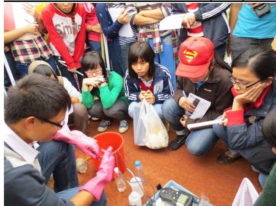
CECR's Youth Leadership Project with IUCN assistance helped young people to analyze pollution levels in various lakes of Hanoi

Following IUCN's interest and capacity survey. the Center for Environment and Community Research (CECR) was given the opportunity to develop its internal technical capacity by obtaining training in financial management, control and reporting for NGOs. In addition, UNDEF-funded support helped CECR to (i) implement a "Youth leadership training project", which monitored pollution levels in selected of Hanoi's many lakes (i.e. purchase of water analysis tools, equipment and survey resources); (ii) launch a lake protection website support communication its administrating the website. CECR's director visà-vis the evaluators described the assistance as