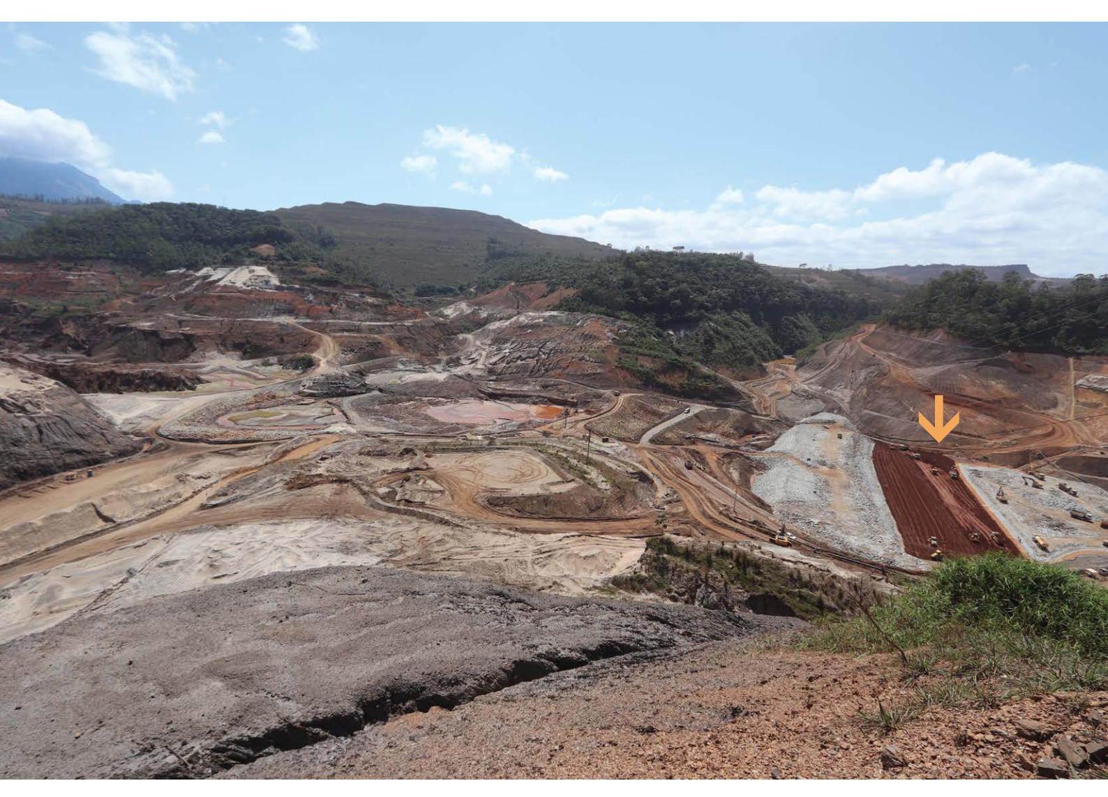
Figure 1. View of Fundão Dam site. On the right, a permanent dam referred to as S1, is being constructed to contain the tailings remaining on site. This dam is part of the actions determined by government agencies to address tailings management (October 2018).