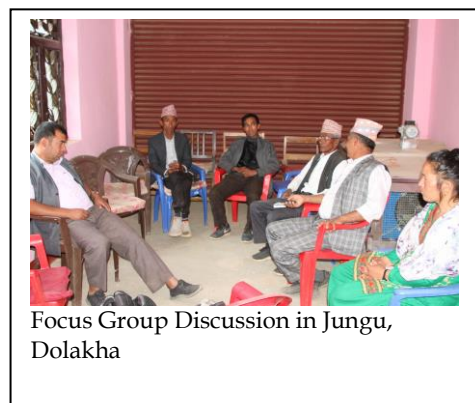
Focus Group Discussion in Jungu, Dolakha

Field study was conducted from April 26 to 30 in both the Districts (detail in annexes 5 and 6). The team conducted Focus Group Discussions in Sikles of Madi Rural Municipality in Kaski District and Jungu of Gaurishankar Rural Municipality in Dolakha District. The ETR team also conducted interviews with the Officials of the Division Forest Office, Annapurna Conservation Area Project (ACAP), and secretary of Conservation Area Management Committee of ACAP in Kaski. Key Informant Interviews were conducted