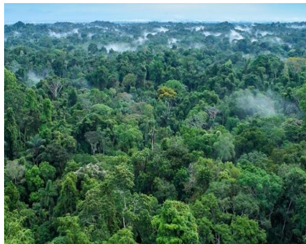
Example of a carbon-rich, high biodiversity tropical rainforest Yasuni National Park, Ecuador

UNFCCC COP 27 underlined “...the urgent need to address in a comprehensive and synergistic manner, the interlinked global crises of climate change and biodiversity loss in the broader context of achieving the Sustainable Development Goals, as well as the vital importance of protecting, conserving, restoring and sustainably using nature and ecosystems for effective and sustainable climate action” (CMA 4 para 1),