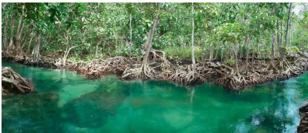
Example of a carbon-rich, high biodiversity mangrove forest Krabi, Thailand.

All pathways to attaining the Paris Agreement target of limiting average global temperature increases to well under 2°C above pre-industrial levels require protecting the global carbon sinks and reservoirs in natural ecosystems, in addition to rapid and drastic declines in GHG emissions. One fundamental and well-recognized tool is the protection of carbon-rich ecosystems such as primary forests, peatlands, grasslands, coastal blue carbon and marine biota, as well as the restoration of lost and damaged terrestrial, freshwater, coastal and marine ecosystems. These ecosystems are often referred to as 'carbon-rich' because they sequester and store more carbon than other ecosystems.