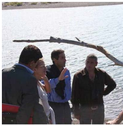
Field visit to the Buna River Protected Landscape