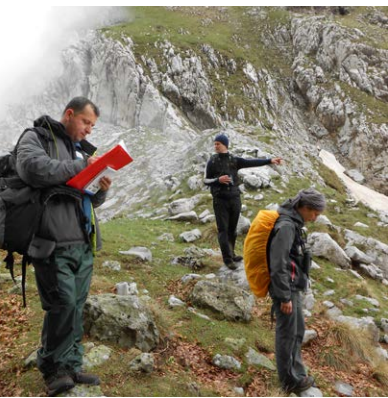
Birds monitoring in Shebenik-Jabllanicë National Park