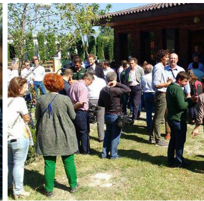
Velipoje visitor centre opening