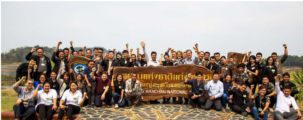
Participants of the three-day training workshop, 28 February to 2 March 2017 at Kaeng Krachan Forest Complex, Phetchaburi Province, Thailand.

A three-day training workshop on “Engaging indigenous peoples and local communities in participatory management of protected areas and benefit sharing” took place from 28 February to 2 March 2017 at the Kaeng Krachan Forest Complex, Phetchaburi Province, Thailand. The training workshop was designed to strengthen the capacity of the Department of National Parks, Wildlife and Plant Conservation to engage indigenous peoples and local communities in the management of protected areas and World Heritage Sites.