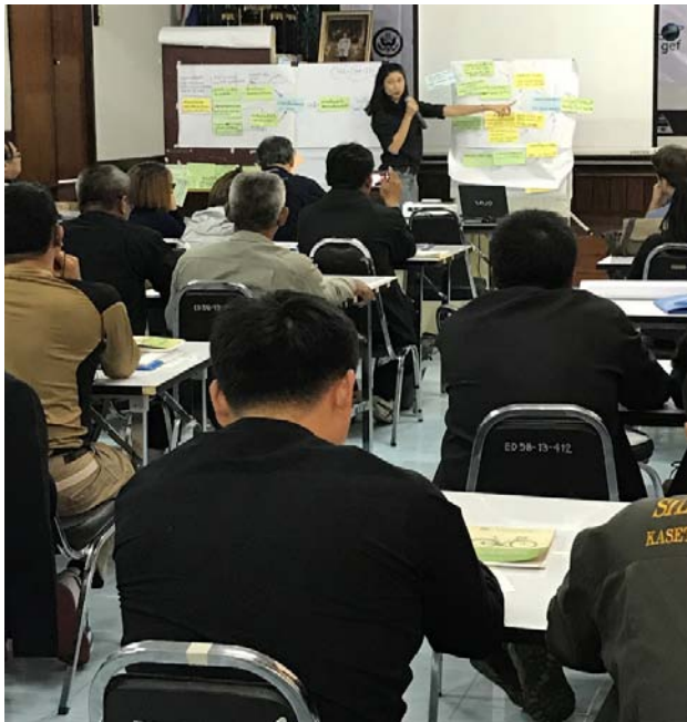
A participant of the workshop presenting results chains from group work