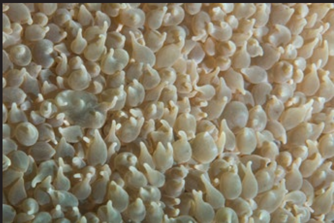
BUBBLE CORAL ( Physogyra lichtensteni )