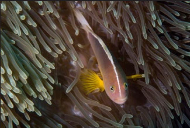
SKUNK ANEMONEFISH ( Amphiprion akallopisos )