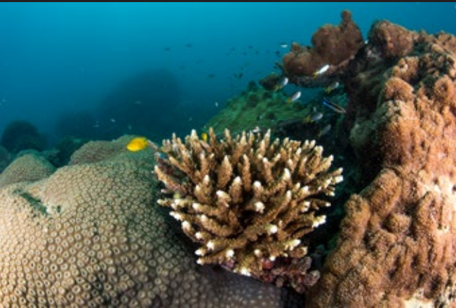
BRANCHING CORAL ( Acropora )