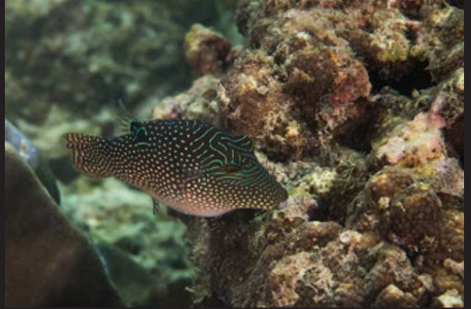
SPOTTED TOBY ( Canthigaster solandri )