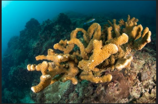
CAULIFLOWER CORAL ( Pocillopora eydouxi )