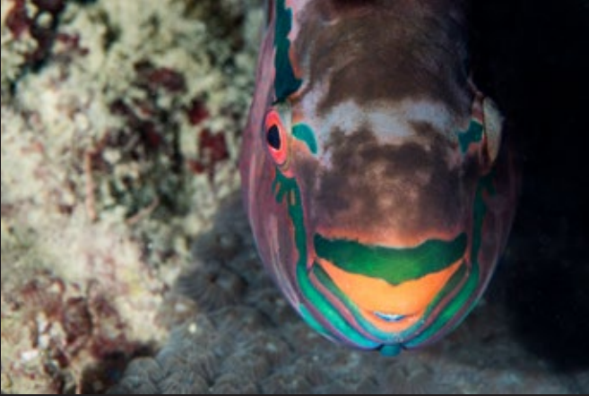
REDLIP PARROTFISH ( Scarus rubrobiaceus )

Similar to their terrestrial namesake, Parrotfish are vibrantly colored with a beak-like jaw of fused teeth. They can reach up to 2 meters and they feed on coral and limestone substrates, making them a major contributor to the fine, white sand on beaches. At night they create a mucus sack around their body while they sleep, and can be seen nestled into crevices of the reef.