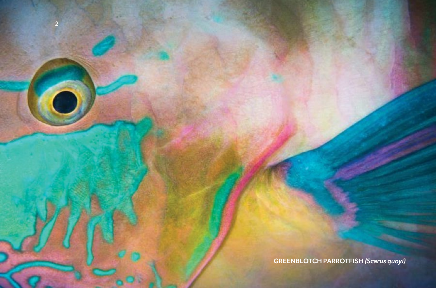
GREENBLOTCH PARROTFISH ( Scarus quoyi )