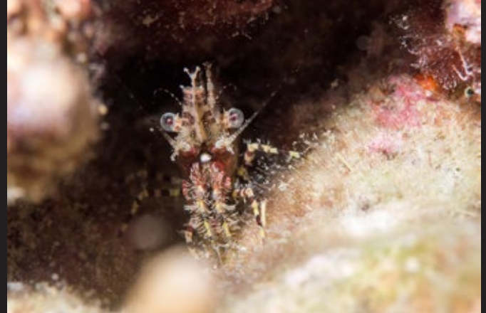
Marble Shrimp ( Saron spp.)