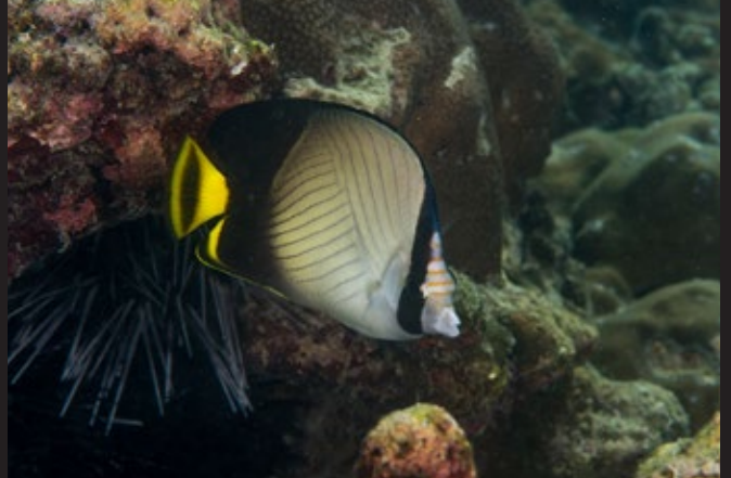
INDIAN VAGABOND BUTTERFLYFISH ( Chaetodon decussatus )