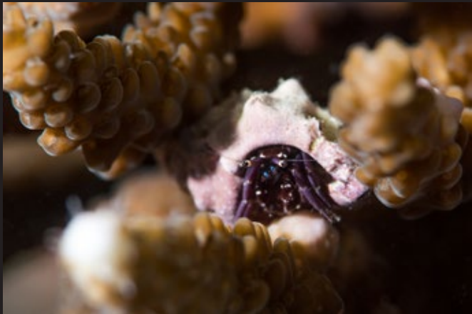
Hermit Crab ( Paguroidea spp.)