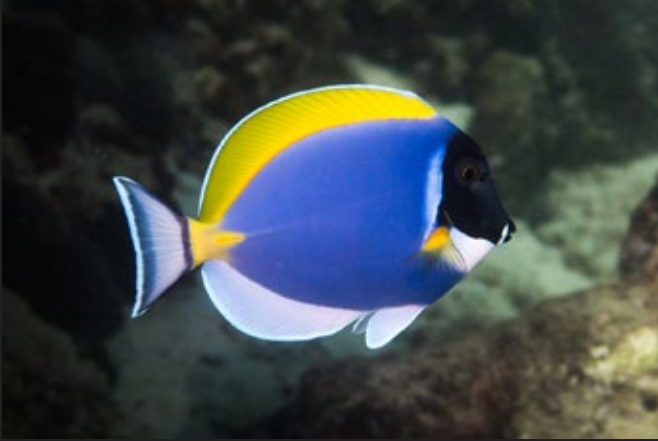
POWDER BLUE SURGEONFISH ( Acanthurus leucosternon )

Characterized by a razor sharp spine on either side of the tail base, which is often referred to as the scalpel, giving this family their common name. Can be identified by their oval, flat side profile, and are generally found in shallow reef areas, from 2 meters deep. Fish can range from 20-100cm in size.