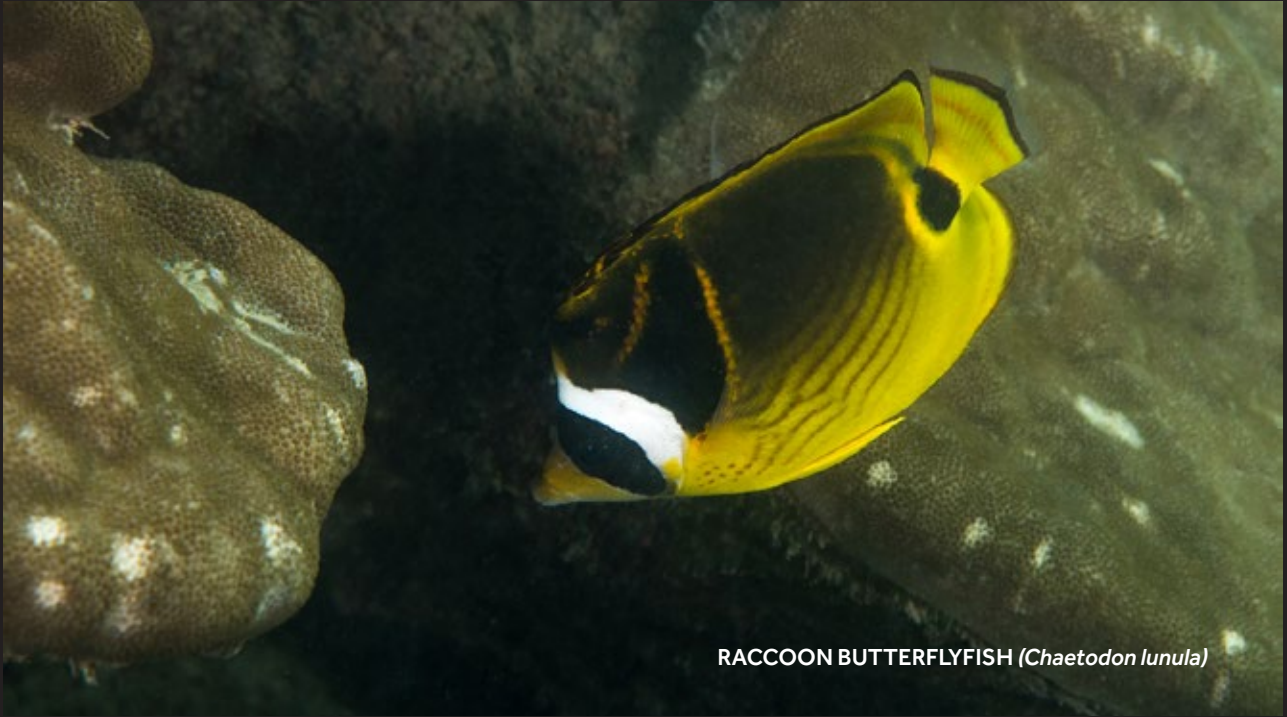
RACCOON BUTTERFLYFISH ( Chaetodon lunula )