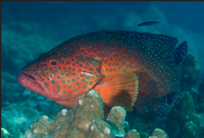
CORAL HIND ( Cephalopholis miniata )

Identified by their torpedo shaped body and prominent jaws with canine teeth, consistent with their carnivorous diet. They are top reef predators, hiding amongst the reef to ambush their prey.