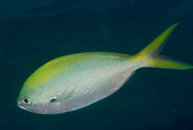
YELLOWBACK FUSILIER ( Caesio teres )

Fast-swimming, schooling species, with a slender streamlined body and forked tail. Feed on fast moving plankton, especially during tidal changes.