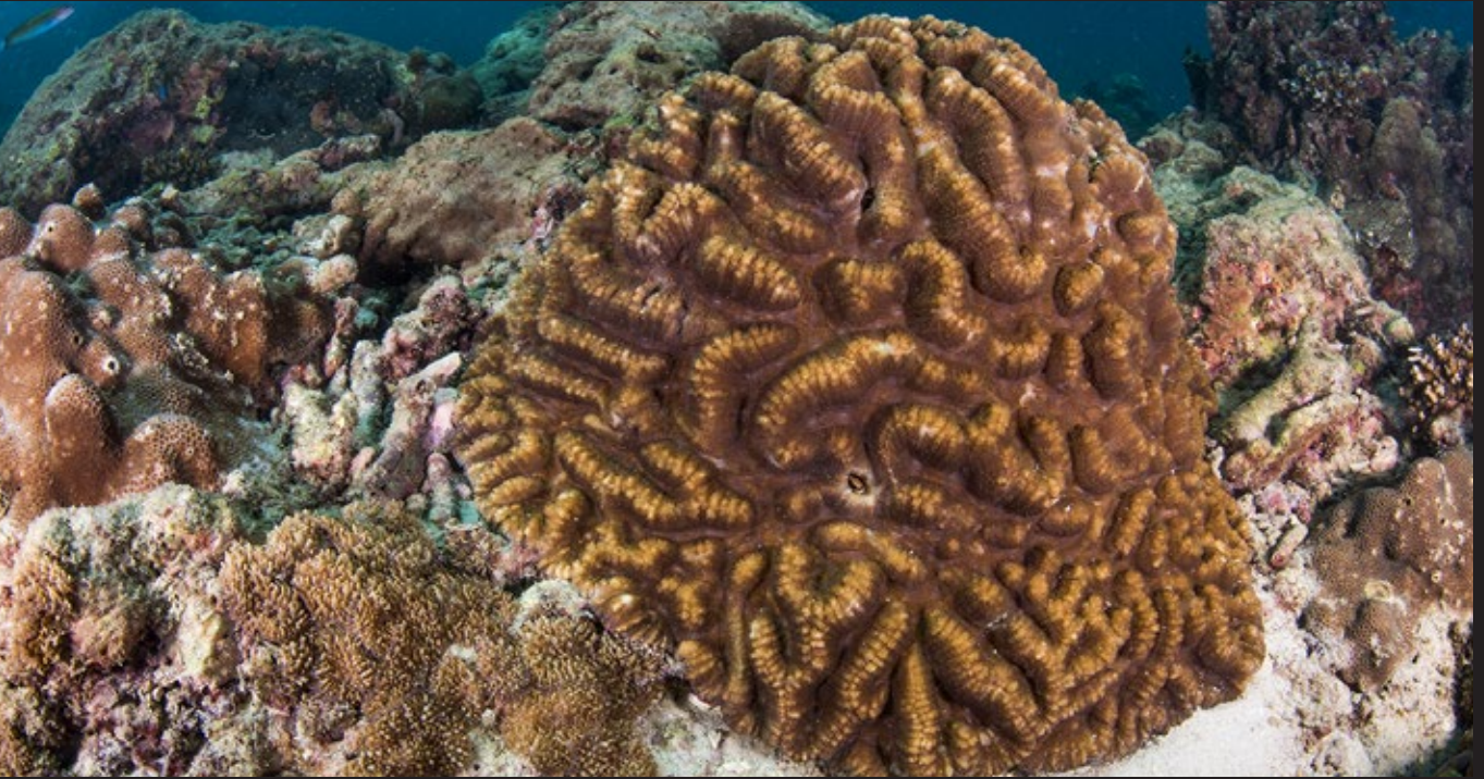
BRAIN CORAL ( Symphyllia radians )