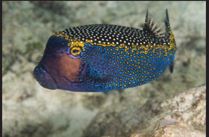
SPOTTED TRUNKFISH ( Ostracion meleagris )