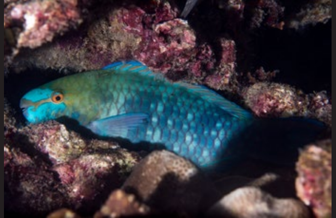
BLUEBARRED PARROTFISH ( Scarus ghobban )