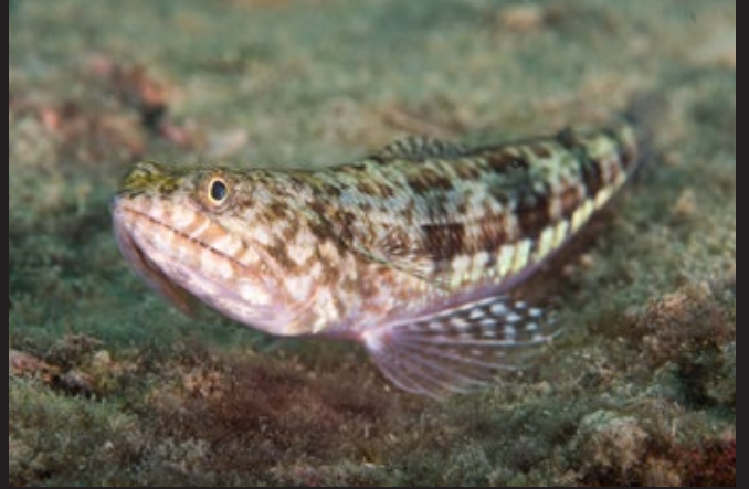
SAND LIZARDFISH ( Synodus dermatogenys )