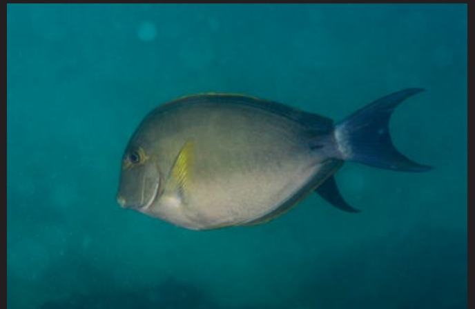
YELLOWFIN SURGEONFISH ( Acanthurus xanthopterus )