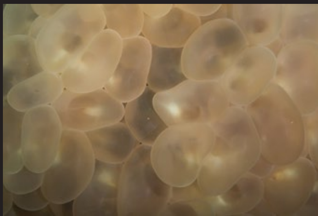
BUBBLE CORAL ( Plerogyra sinuosa )