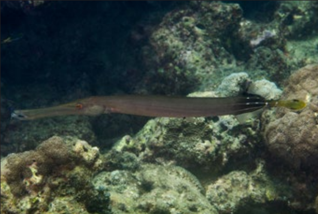
TRUMPETFISH ( Aulostomus chinensis )