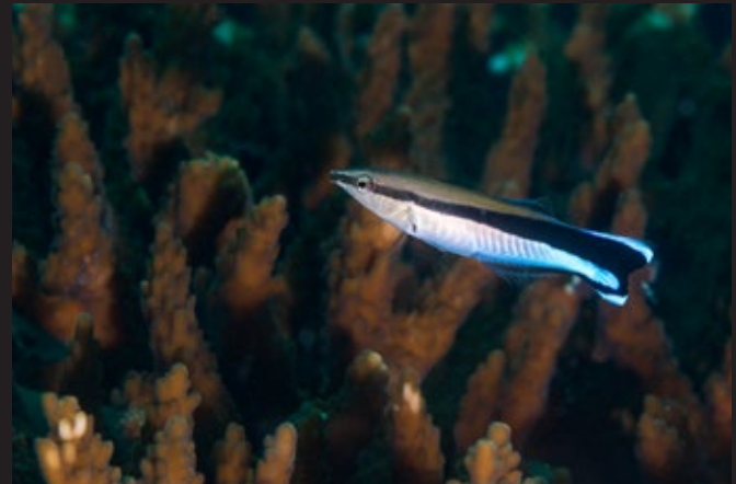
BLUESTREAK CLEANER WRASSE ( Labroides dimidatus )

PHUKET MARRIOTT RESORT & SPA, MERLIN BEACH