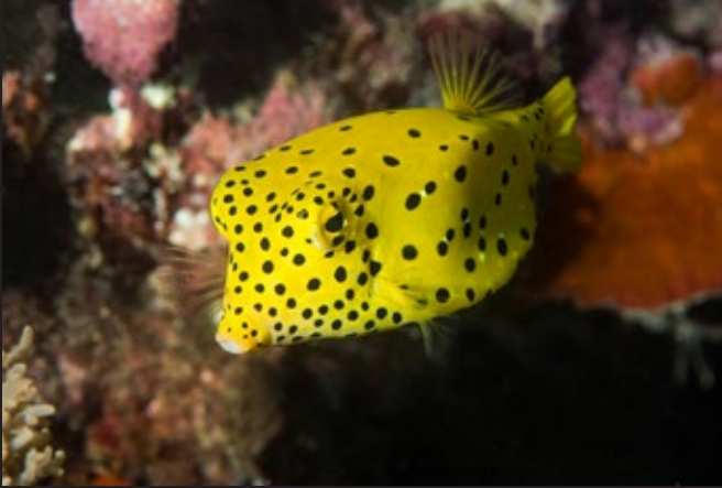
JUVENILE YELLOW BOXFISH ( Ostracion cubicus )