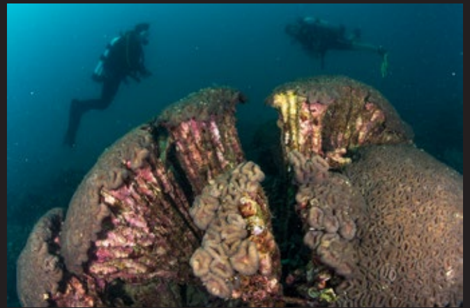
BRAIN ROOT CORAL ( Lobophyllia hemprichii )