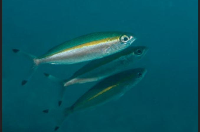
GOLDBAND FUSILIER ( Pterocaesio chrysozona )

PHUKET MARRIOTT RESORT & SPA, MERLIN BEACH