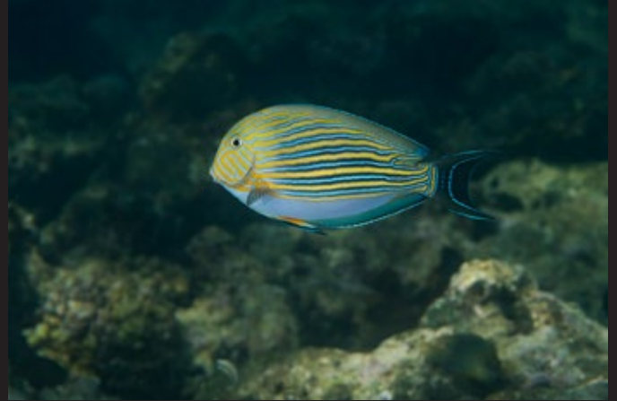
STRIPED SURGEONFISH ( Acanthurus lineatus )