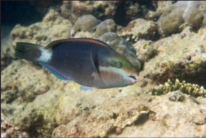
PALE BULLETHEAD PARROTFISH ( Chlorurus capistratoides )