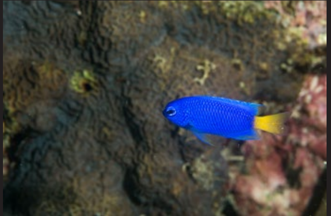
NEON DAMSELFISH ( Pomacentris pavo )