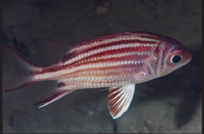
REDCOAT ( Sargocentron rubrum )