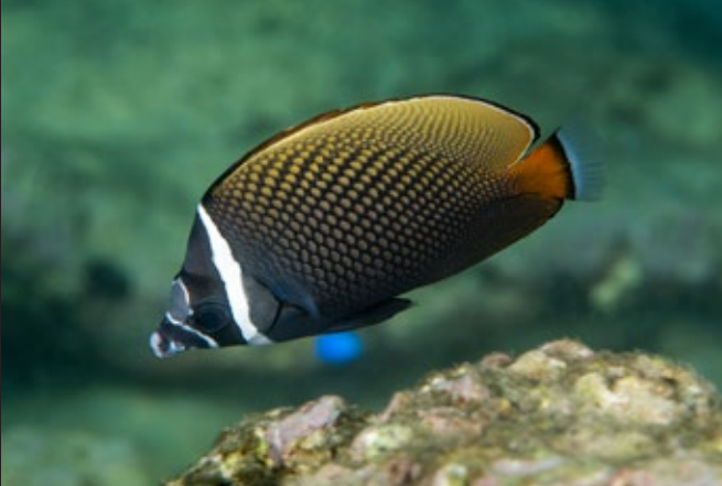
COLLARE BUTTERFLYFISH ( Chaetodon collare )