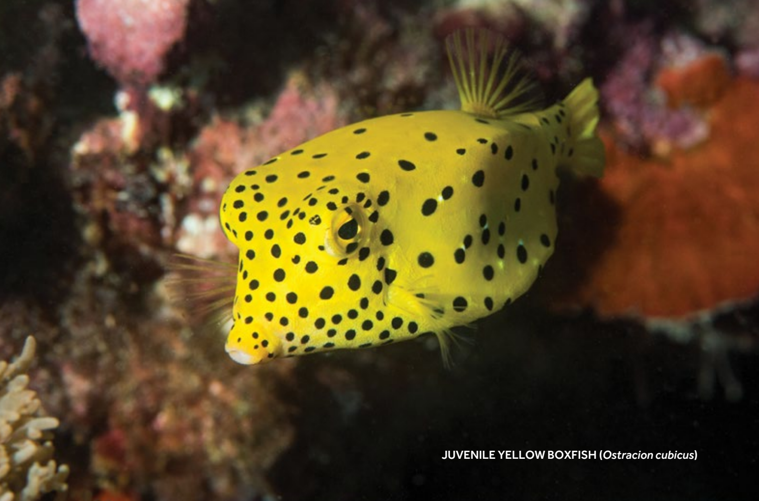
JUVENILE YELLOW BOXFISH ( Ostracion cubicus )