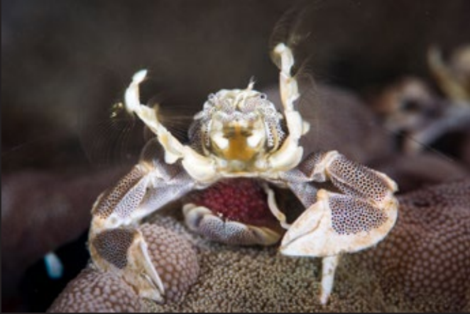
Porcelain Crab ( Neopetrolisthes maculatus ) with eggs

Crustaceans belong to the phylum Arthropoda, which includes the land-dwelling insects, spiders, scorpions and others. They are incredibly diverse, armored insects with a soft inner body. They have jointed limbs, often with pincer-like claws.