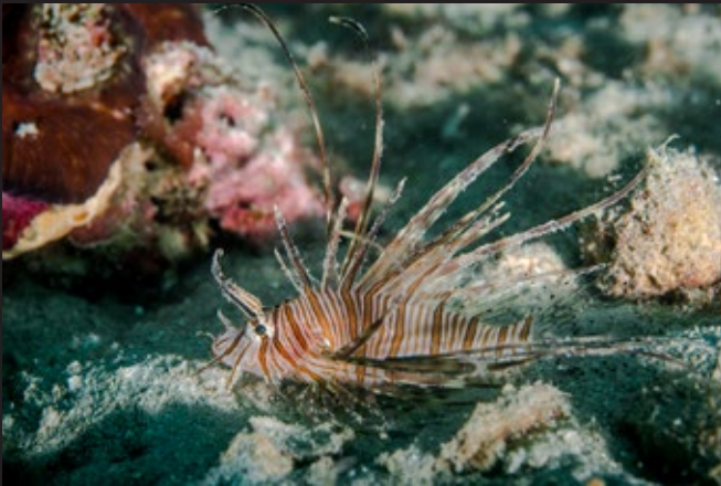
JUVENILE LIONFISH ( Pterois volitans )

A diverse family of fishes, their name is derived from their venomous spines, which provide protection from predators, and also allow the fish to camouflage into the reef. They are nocturnal predators that feed on crustaceans and small fish using ambush techniques.