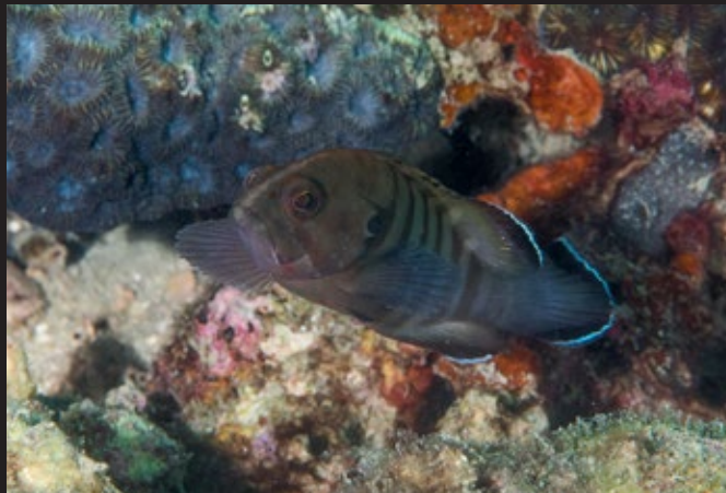
CHOCOLATE HIND ( Cephalopholis boenak )

PHUKET MARRIOTT RESORT & SPA, MERLIN BEACH