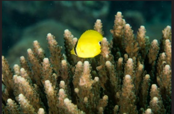
JUVENILE ANDAMAN BUTTERFLYFISH ( Chaetodon andamanensis )