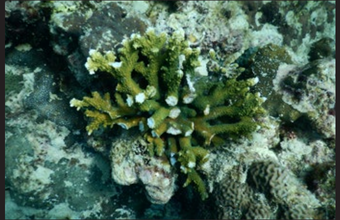
ACROPORA CORAL THAT WAS LIKELY DAMAGED BY ANCHORING