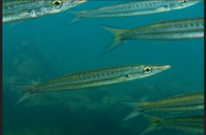
PICKHANDLE BARRACUDA ( Sphyræna jello )