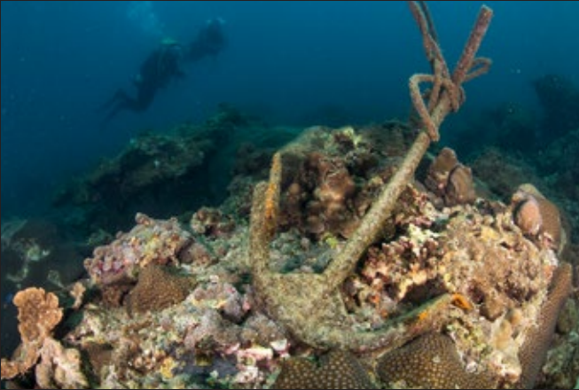
ABANDONED ANCHOR ON THE REEF

Coral are also susceptible to physical damage from boat anchors and walking on the reef. Boats that anchor on the reef, for either fishing or snorkeling, drop anchors that can destroy corals, which may have taken more than 50 years to grow to such sizes. Our team works to educate hotel guests about their effects on corals, and encourages guests to go swimming only at high tide, and to be careful when snorkeling with long flippers.