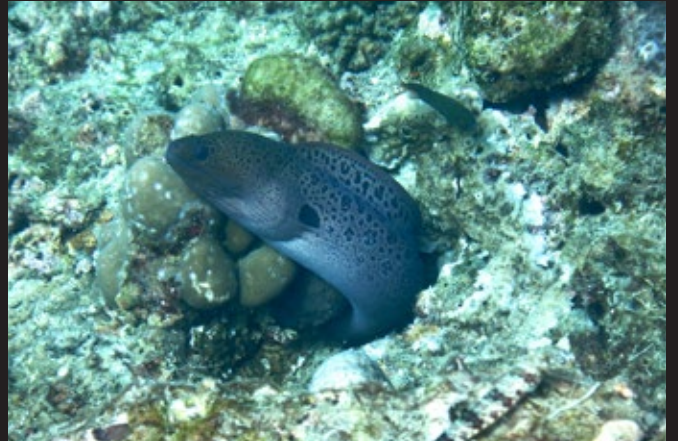
GIANT MORAY ( Gymnothorax javanicus )