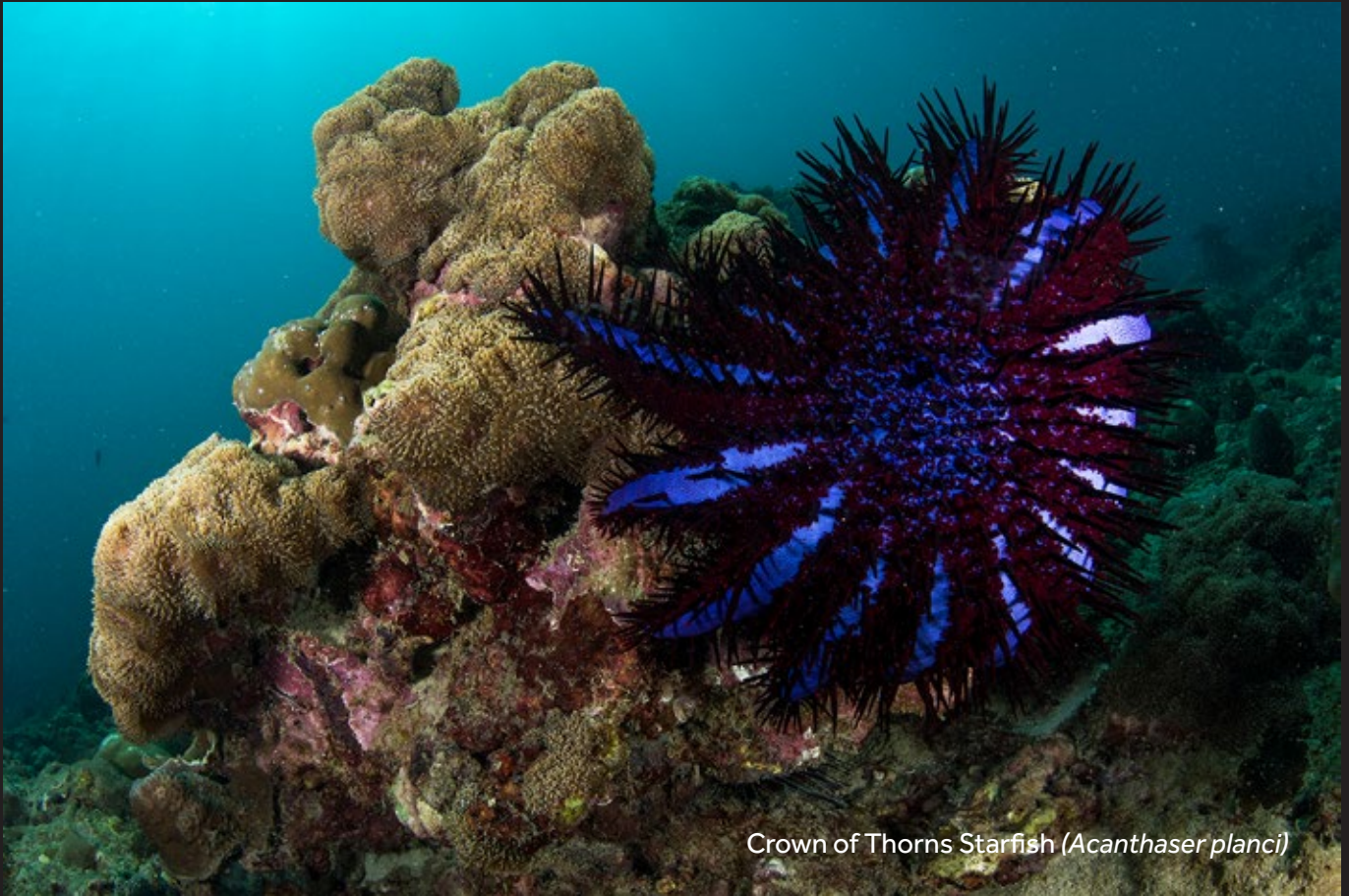
Crown of Thorns Starfish ( Acanthaster planci )