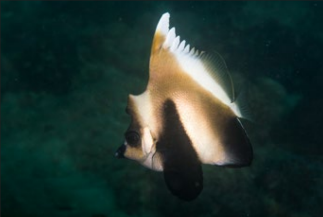
INDIAN BANNERFISH ( Heniochus pleurotaenia )