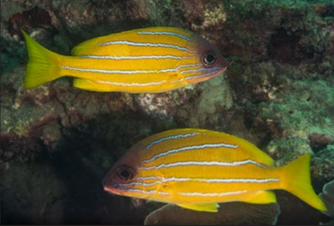
FIVE-LINED SNAPPER ( Lutjanus quinquelineatus )