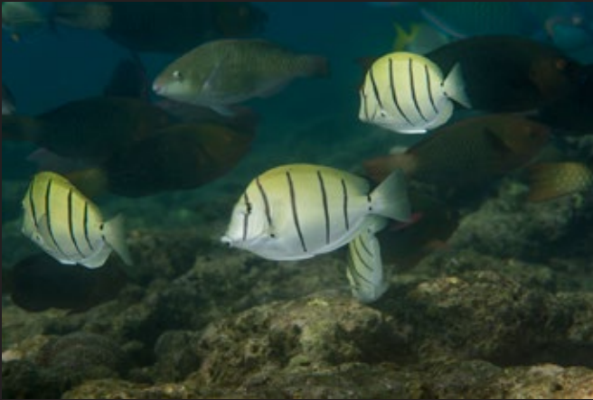
CONVICT TANG ( Acanthurus tristegus )