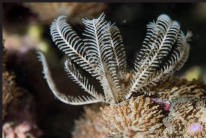
Feather Star ( Stephanometra echinus )