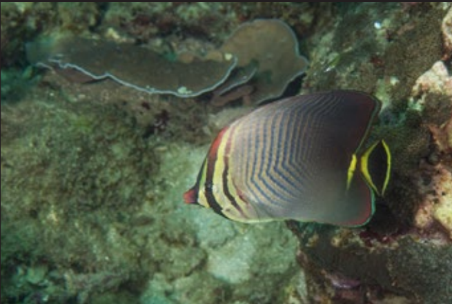
TRIANGULAR BUTTERFLYFISH ( Chaetodon triangulum )