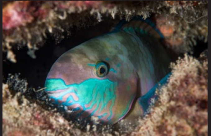
GREENBLOTCH PARROTFISH ( Scarus quoyi )