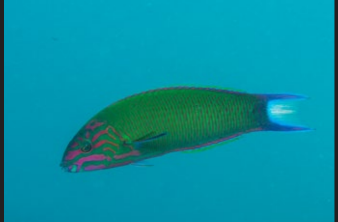
MOON WRASSE ( Thalassoma lunare )

Predominantly brightly colored fish ranging in shape and size. Carnivorous fish that use powerful jaws to feed on worms, sea urchins, and corals, among other animals.