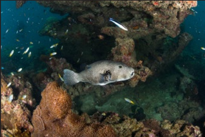
STAR PUFFER ( Arothron stellatus )