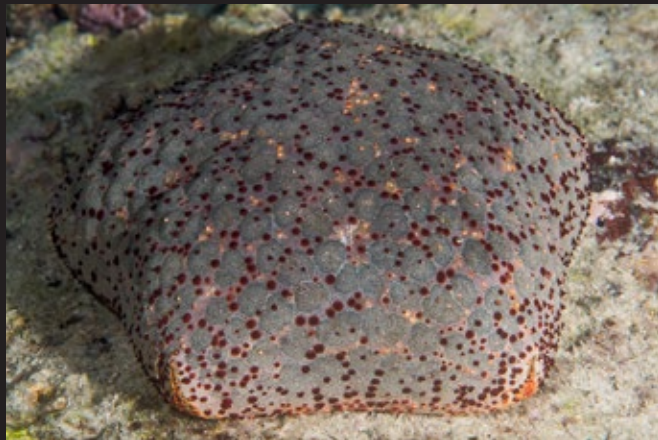
Cushion Star ( Culcita novaeguineae )