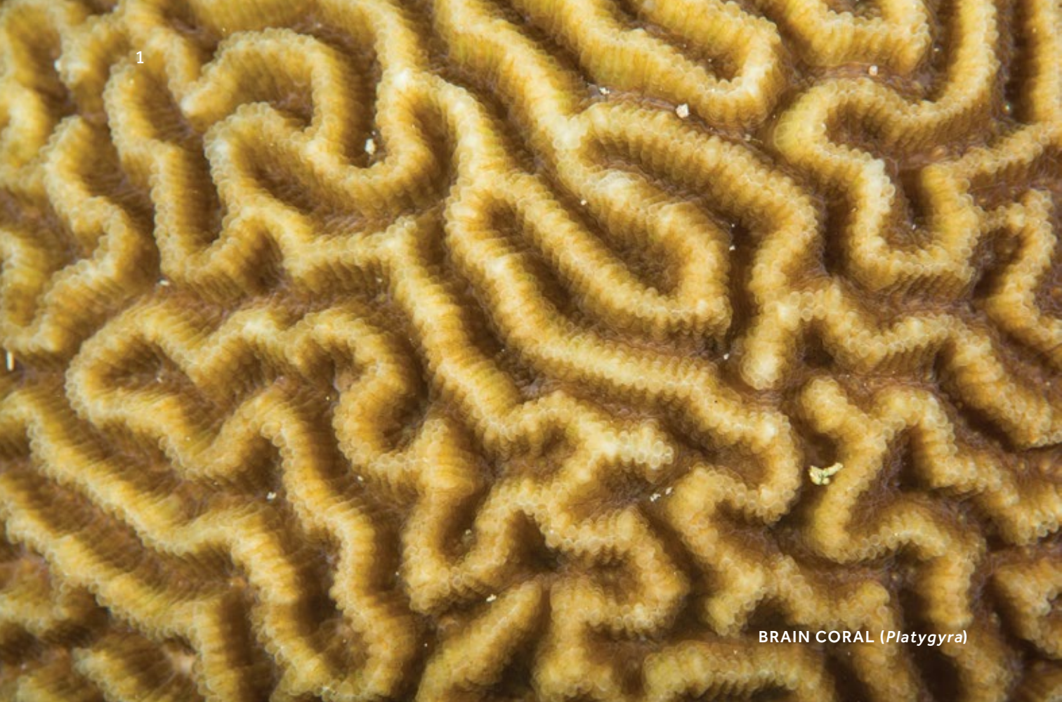
BRAIN CORAL ( Platygyra )