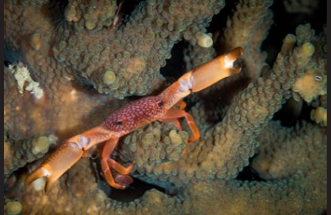
Guard Crab ( Trapezia spp.)