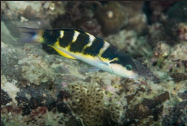
JANSEN'S WRASSE ( Thalassoma janseni )