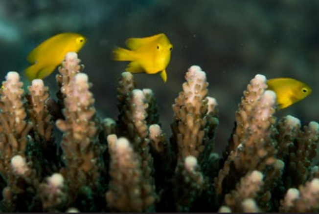
GOLDEN DAMSELFISH ( Amblyglyphidodon aureus )