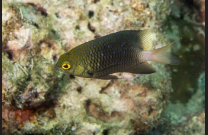
JEWEL DAMSELFISH ( Plectroglyphidodon lacrymatus )