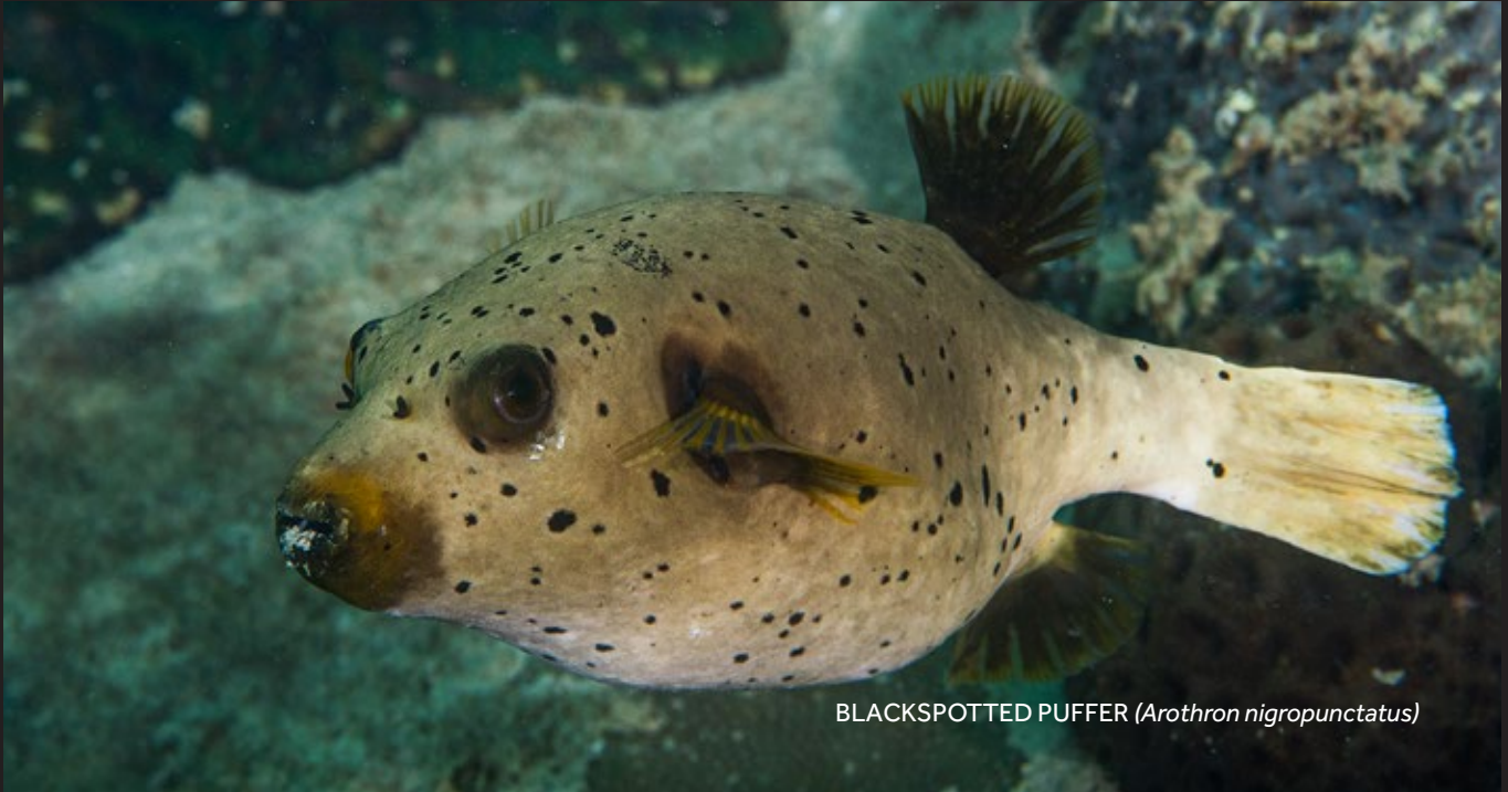
BLACKSPOTTED PUFFER ( Arothron nigropunctatus )