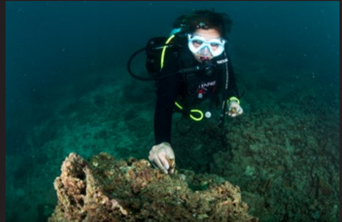
DIVERS 'REPLANTING' BROKEN CORAL FRAGMENTS ON TO THE REEF