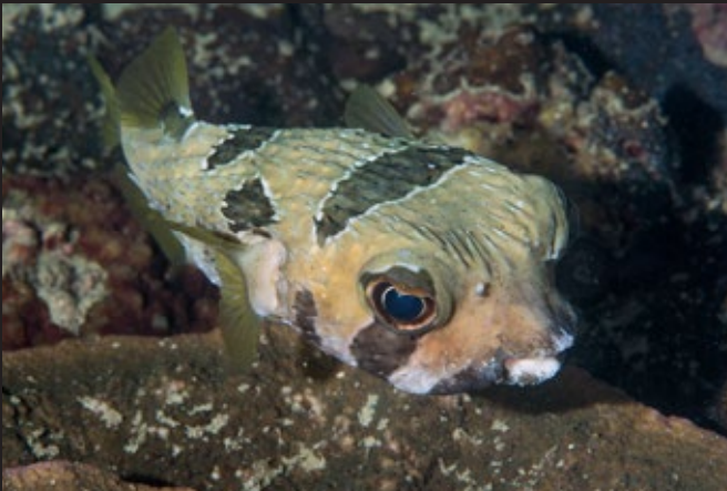
BLACK BLOTCHED PORCUPINEFISH ( Diodon liturosus )