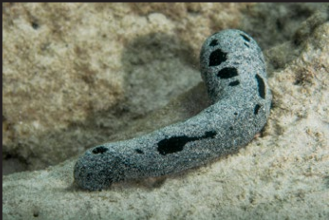
Black Sea Cucumber ( Holothuria atra )