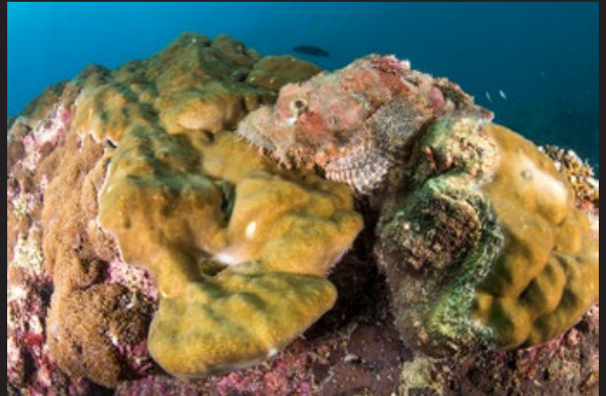
TASSLED SCORPIONFISH ( Scorpaenopsis oxycephala )

PHUKET MARRIOTT RESORT & SPA, MERLIN BEACH