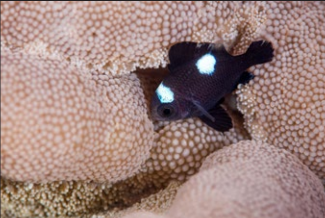
THREE-SPOT DASCYLLUS ( Dascyllus trimaculatus )