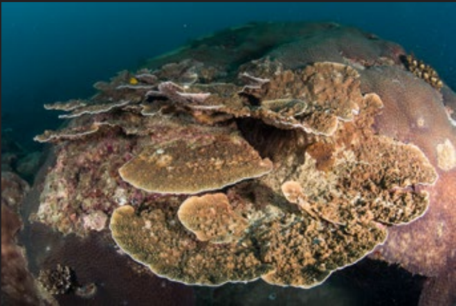
HEDGEHOG CORAL ( Echinopora lamellosa )