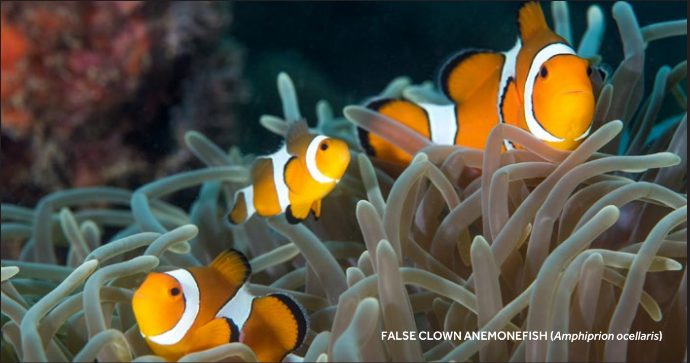
FALSE CLOWN ANEMONEFISH ( Amphiprion ocellaris )