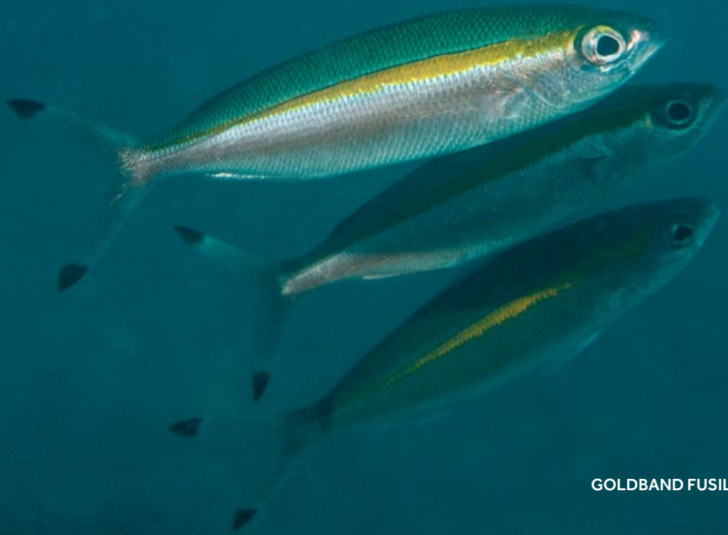
GOLDBAND FUSILIER ( Pterocaesio chrysozona )