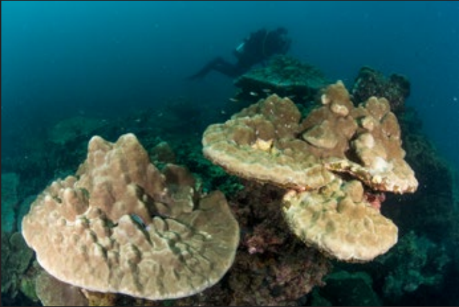
FINGER CORAL ( Porites lutea )