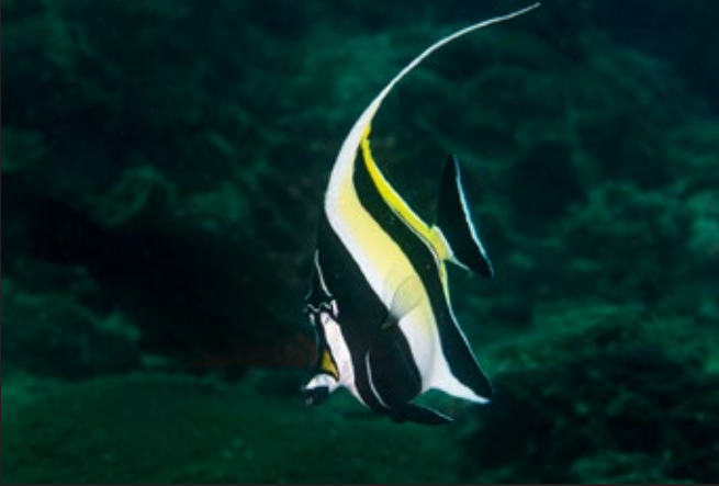
MOORISH IDOL ( Zanclus cornutus )