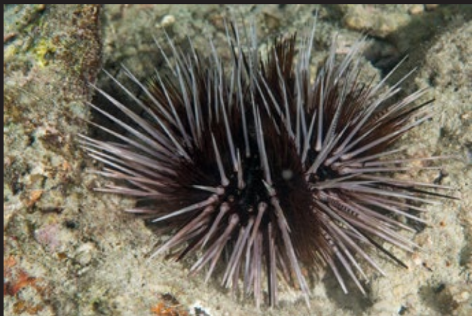
Black and White Sea Urchin ( Diadema savignyi )