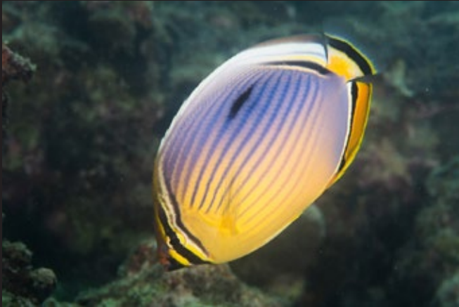
OVAL BUTTERFLYFISH ( Chaetodon trifasciatus )