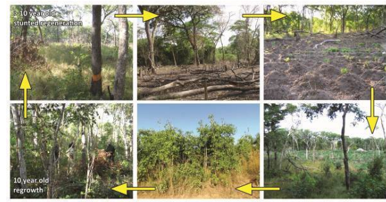
Figure 2. Cyclic clearing-cropping-fallow-regrowth maintains diversity & productivity of Miombo (Source: Geldenhuys, 2016).

decisions are being made without a proper appreciation of the contribution of Miombo woodlands to national treasury.