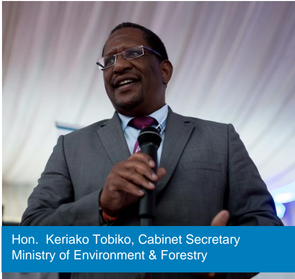
Hon. Keriako Tobiko, Cabinet Secretary Ministry of Environment & Forestry

Opening the session, the Cabinet Secretary Ministry of Environment & Forestry, Kenya, Hon. Keriako Tobiko highlighted the government's and political commitment to end the plastic waste menace in the country. He referenced successes of the recent ban on plastic carrier bags which has contributed to the reduction in plastic waste that ends up into the water bodies. He said that a lot still needs to be done hence a recent collaborative framework with industry and the private sector to find sustainable solutions to other plastic waste in the country. 'Specifically, on PET, the government has a collaborative framework with KAM to allow them to establish a takeback scheme,' he said.