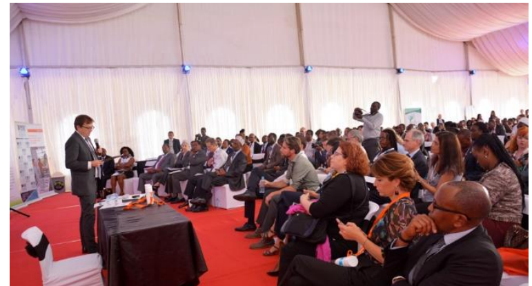
Hon. Jonathan Wilkinson, Minister of Fisheries and Oceans Canada, call to action.