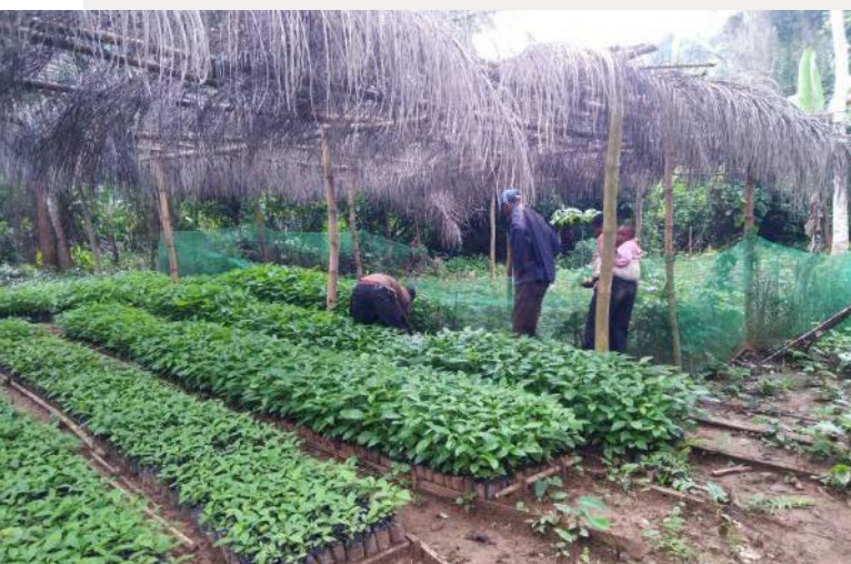
Some community members uprooting seedlings from the nursery to be transported to the planting site.

For example, Guinness Ghana Breweries PLC (Diageo) faced a water pollution crisis and was interested in securing water resources and ecosystems in the Densu basin. A Rocha Ghana proactively engaged with Guinness Ghana, provided information on water security issues and also arranged for their participation in a study tour to Ecuador so that they could learn more about state-of-the-art water security solutions that are