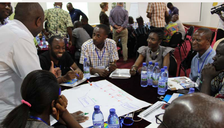
SRJS training in Ghana.

“Without collaboration the court case would not have been filed, and companies and CSOs in Uganda wouldn’t be engaging regularly.” - Representative from AFIEGO.