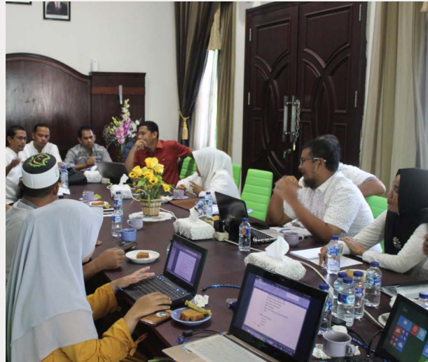
Peusangan Watershed Forum (FDKP) in a meeting with district government to revise a spatial plan for sand and gravel zonation.

After raising the awareness of customary leaders about mining regulations, WWF Indonesia trained local communities on how to report cases of illegal extraction through citizen journalism. Building on this local wisdom, the communities now work closely with the government and local businesses, including sand and gravel mining, a fertiliser company and a local water company, to ensure the maintenance of a fresh water supply, which also includes their participation in a payment for ecosystem services scheme that is managed by the Watershed Forum. As more community members reported on the situation, the government has since improved law enforcement and revised district spatial plans where there will be a specific zonation for sustainable sand and gravel extraction. With zoning, it is easier to monitor illegal activities and