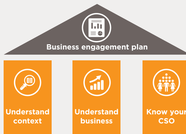
Figure 1: Representation of a business engagement plan – building on solid foundations

with tailored and targeted messages. A full list of suggested questions can be found in the template at the end of the document (Table 1).