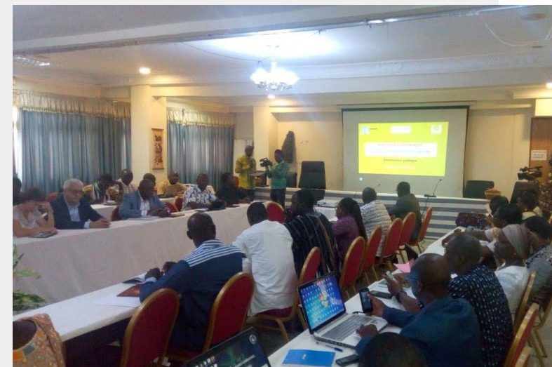
A public conference on the FMDL in Burkina Faso in 2018.

Though the campaign has engaged broadly with stakeholders and received a lot of national and international media attention, the government still intends to mine Atewa for bauxite. In response, in January 2020, a coalition of NGOs and private citizens filed a Civil Action at the High Court of General Jurisdiction against the Government of Ghana stating the Atewa plans are in violation of the right to a safe and healthy environment. 22 The State Attorney has denied all the allegations in the plaintiffs' statement of claim under the Civil Action and recommended that the case be dismissed. A ruling on the case is expected in 2021. The campaign is now shifting again towards international actions, such as submitting the Atewa Motion 103 23 to the IUCN Members' Assembly. This is in addition to CSO engagement with top global mining transparency, accountability and sustainability standards which aim to ensure that Atewa Range Forest is secure, now and for the future, and its water provisioning, biodiversity security and climate amelioration services are protected.