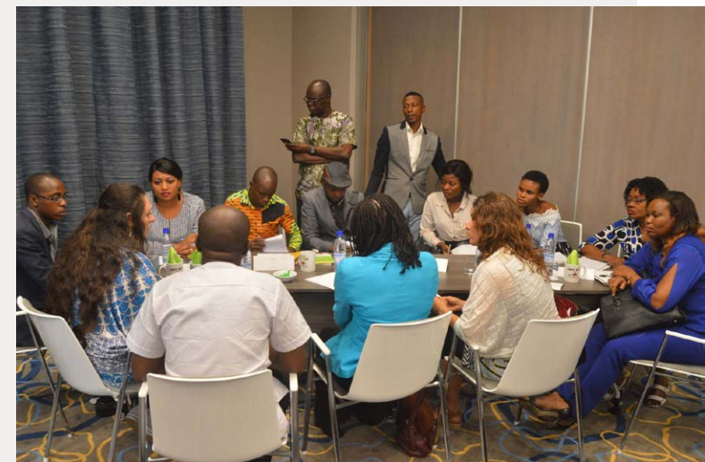
Businesses meet with CSOs at CSR Café.

See the IUCN BioBiz Exchange Resource Guide for a more detailed explanation on defining the situation. 14