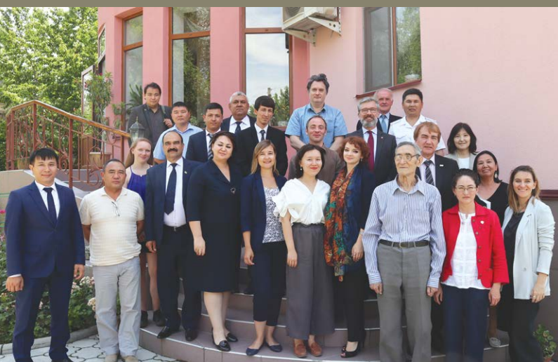
Consultative workshop in Bishkek 2018, Kyrgyzstan, group photo

The study aimed to identify areas, across a regional scale, which display good potential to fulfil the requirements for inscription as natural World Heritage sites, especially those that may qualify under biodiversity criteria (ix) and (x). In addition, the study aimed to outline key strategic recommendations which will further the implementation of the World Heritage Convention in Central Asia.