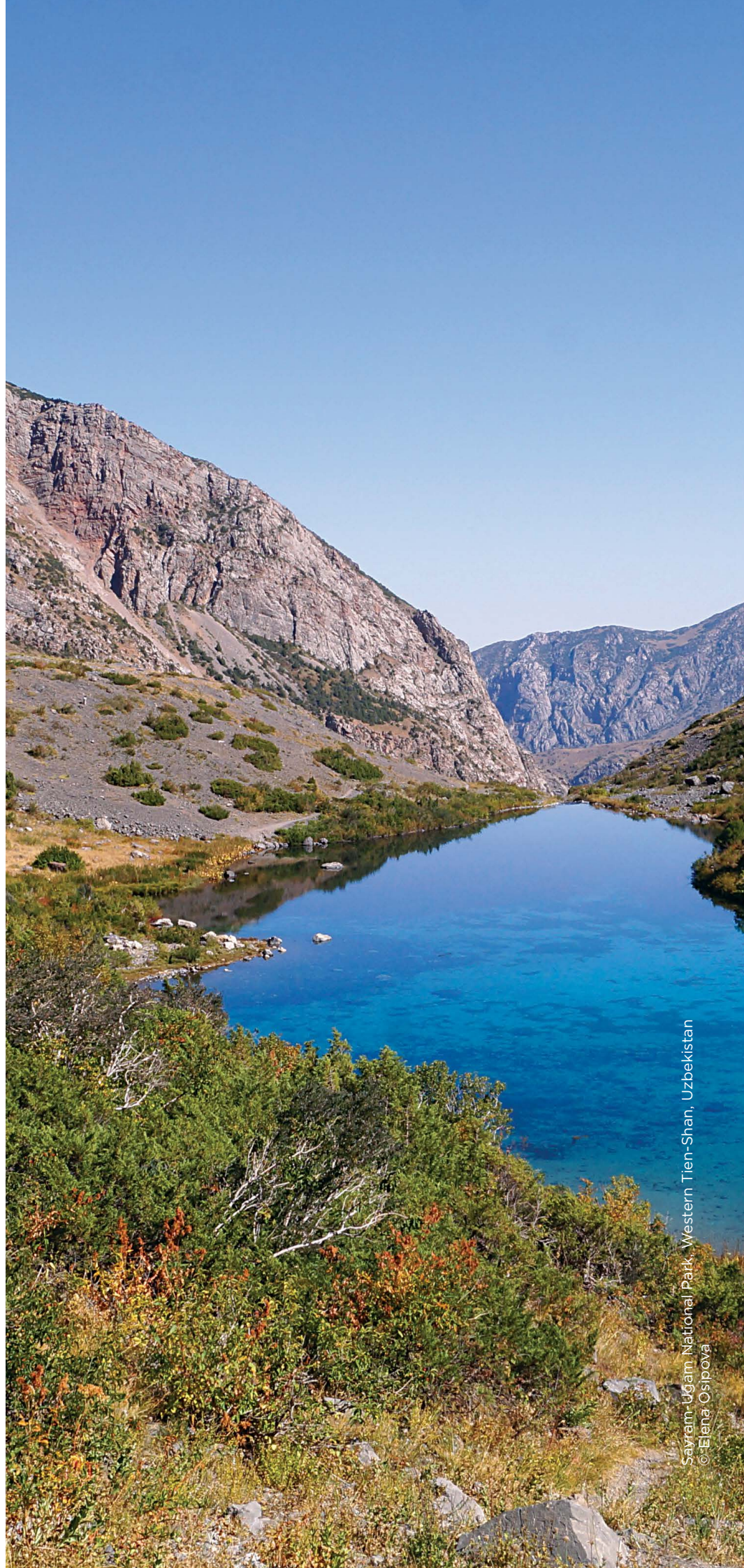
Sayram-Ugam National Park, Western Tien-Shan, Uzbekistan