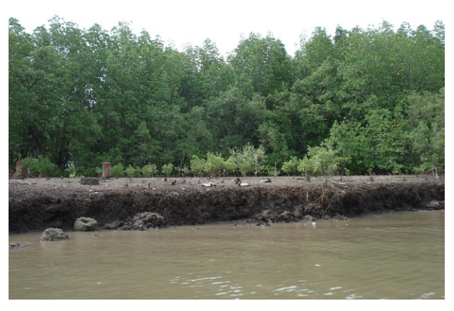
Mangrove rehabilitation.

For the future, the villagers of Ban Kluay Nok would like to get more information about mangrove management, and some money to build a walkway to take local school children and youth groups into the mangroves, teaching about their precious resource.