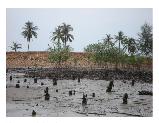
Mangrove rehabilitation.