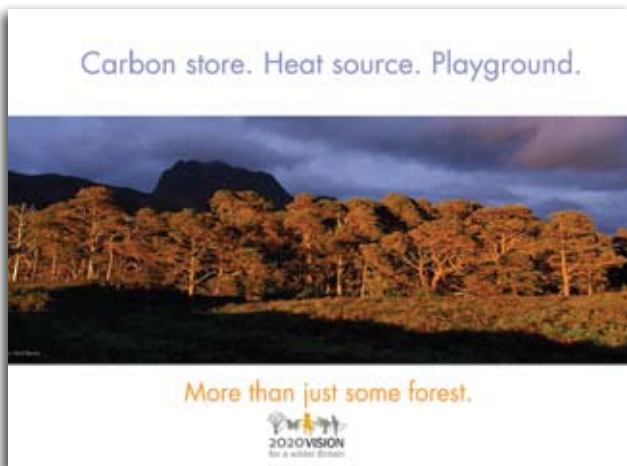
Poster for the 2020VISION conservation media initiative