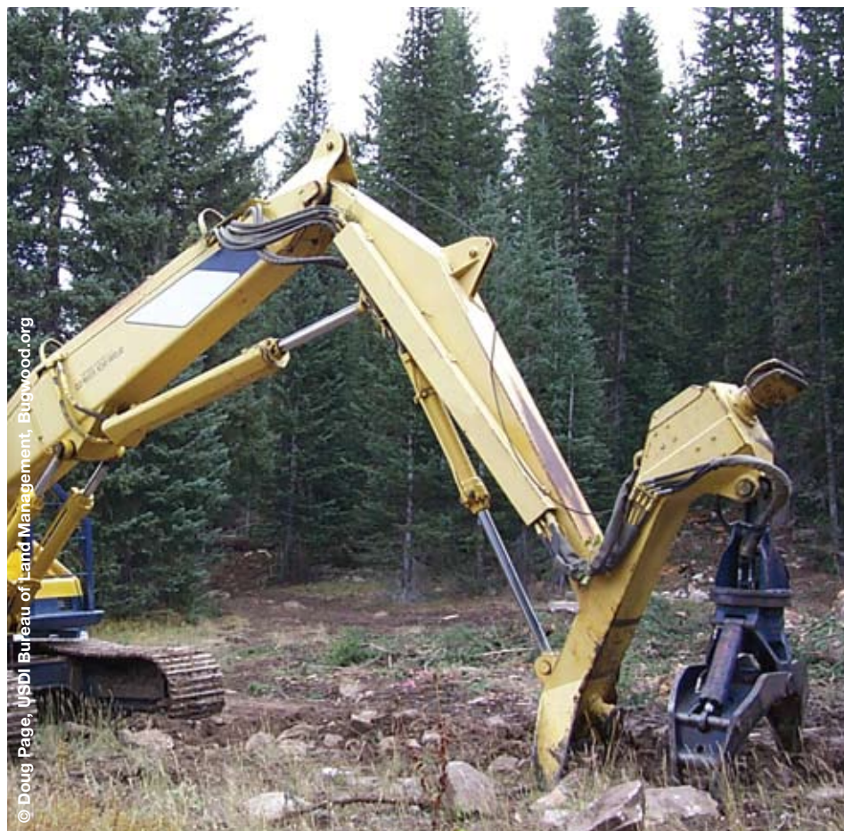
Machinery operators were a key focus of the communication strategy

Frits Hesselink reports on how a biodiversity communication strategy moved from one of informing forest owners to one of supporting specific changes in forest management.