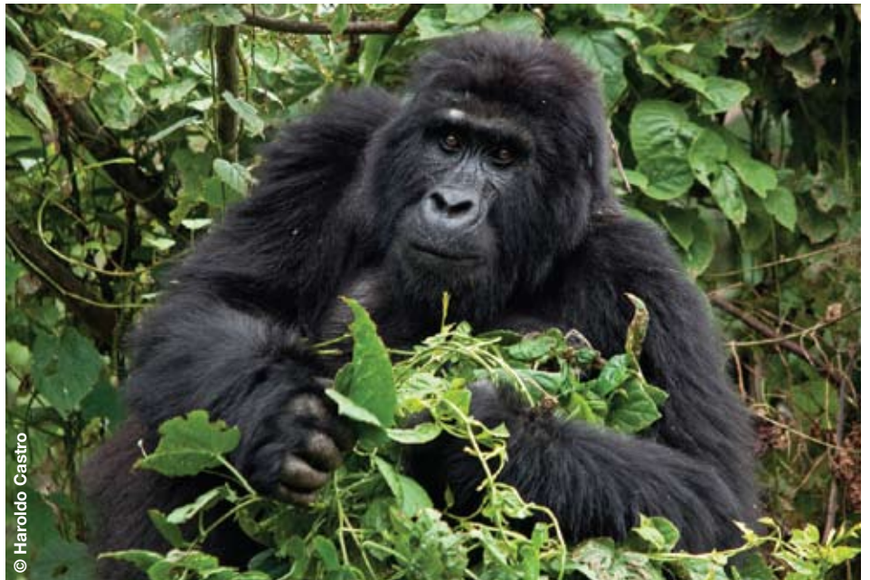
Female mountain gorilla from Bwindi National Park

The great dunes of the Namib-Naukluft National Park and the Communal Conservancies in Namibia were the first to catch our eye. During our 23-day stay in the country, zigzagging between natural areas, we focused on the efforts of NGOs, governmental agencies, local communities and tourism operators to sustainably manage natural resources. Government authorities have designated that almost the entire stretch of the 1570-km long Atlantic coastline should be protected. Combining the existing protected areas with the