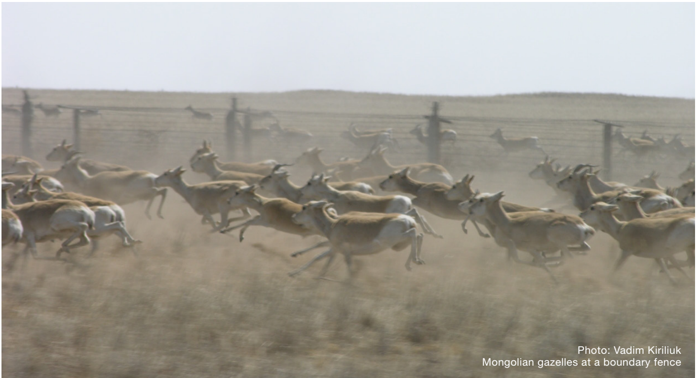
Mongolian gazelles at a boundary fence