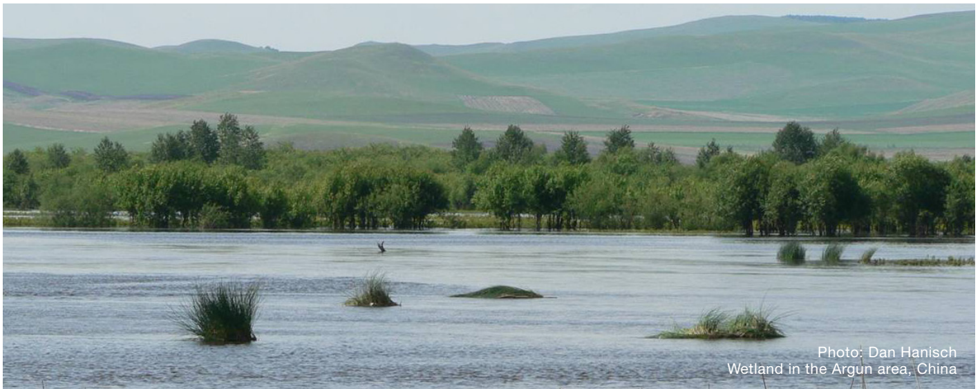
Wetland in the Argun area, China