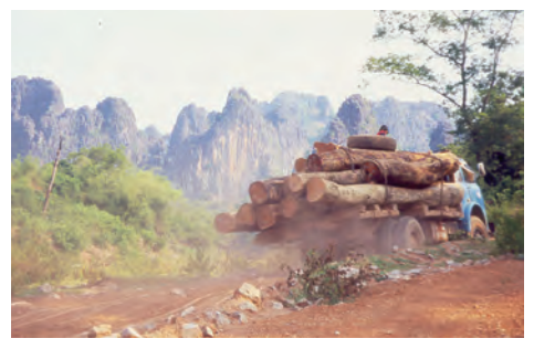
Deforestation of closed tropical rainforests could account for the loss of as many as 100 species a day