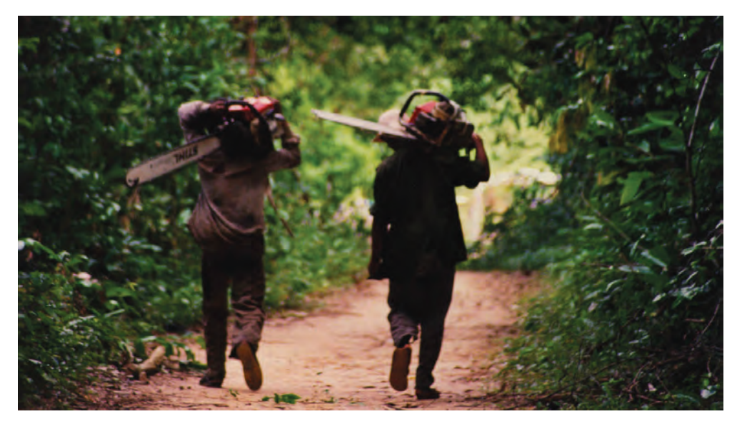
Deforestation accounts for up to 20 percent of the global greenhouse gas emissions that contribute to global warming