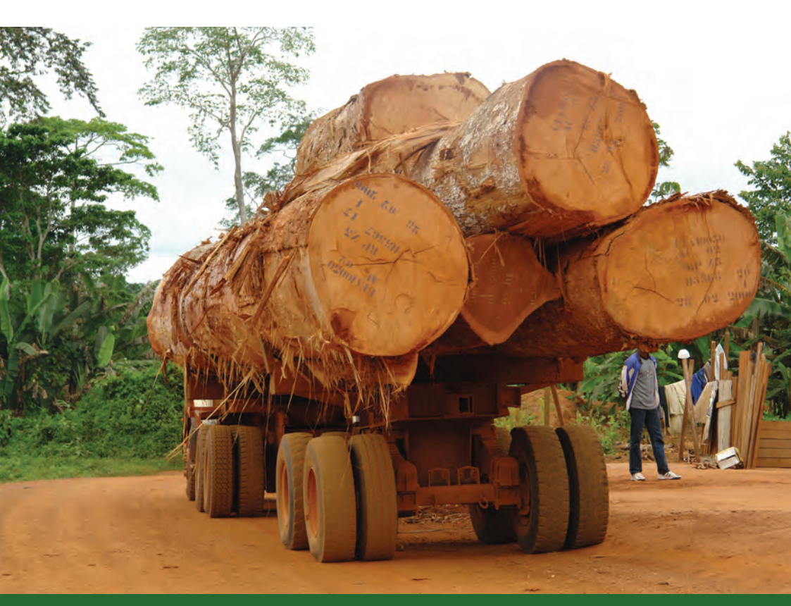
Forest Law Enforcement and Governance (FLEG)

A commitment to change through tripartite action