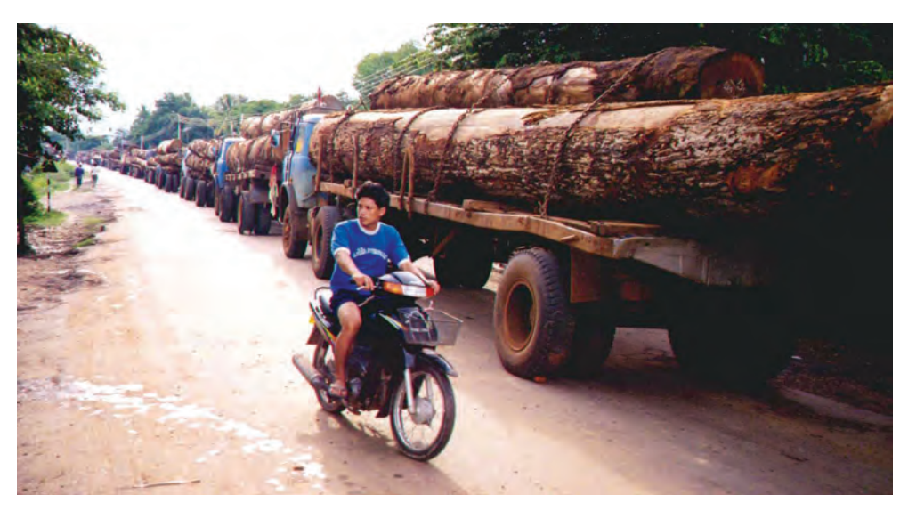
Each year about 13 million hectares of the world's forests are lost due to deforestation