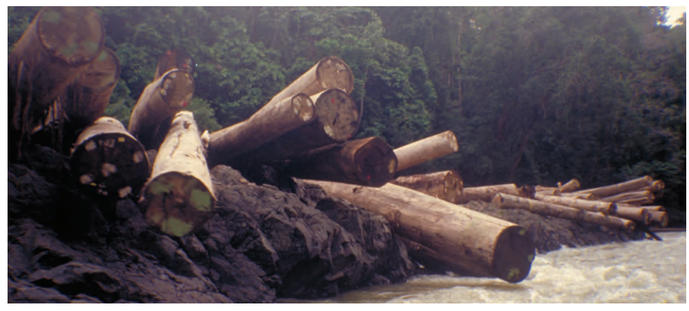
Forests ensure environmental functions such as biodiversity, water and soil conservation, water supply and climate regulation