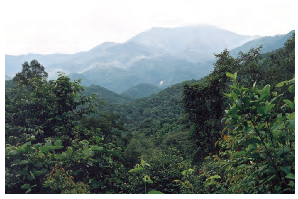
Forests are home to 300 million people around the world