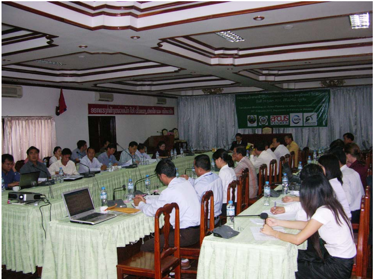
Figure 3. Photo of the Final Consultation Workshop on Gibbon Conservation Action Plan for Lao PDR. Department of Forestry, February 2011.