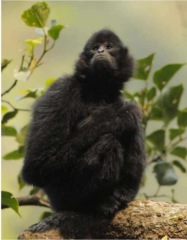
Male black crested gibbon ( Nomascus concolor )