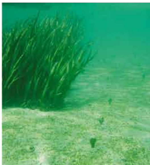
Seagrass diversity: Enhalus acoroides (large) and Halophila ovalis (very small) in Guam.

Sea level rise and altered currents: With future global warming, there may be a 1-5 m rise in the seawater levels by 2100 (taking into account the thermal expansion of ocean water and melting of ocean glaciers, Overpeck et al. 2006, Hansen 2007, Rahmstorf 2007). Rising sea levels may adversely impact seagrass communities due to increases in water depths above present meadows (thereby reducing light), changed currents causing erosion and increased turbidity and seawater intrusions higher up on land or into estuaries and rivers (favouring land-ward seagrass colonisations, Short et al. 2001). Changing current patterns can either erode seagrass beds ("beds" are often used in this text synonymously to "meadows", but may indicate comparatively smaller entities) or create new areas for seagrass colonization. On the positive side, increases in current velocity within limits may cause increases in plant productivity (see Fact Box 9) reflected in leaf biomass, leaf width, and canopy height (Conover 1968; Fonseca and Kenworthy 1987, Short 1987).