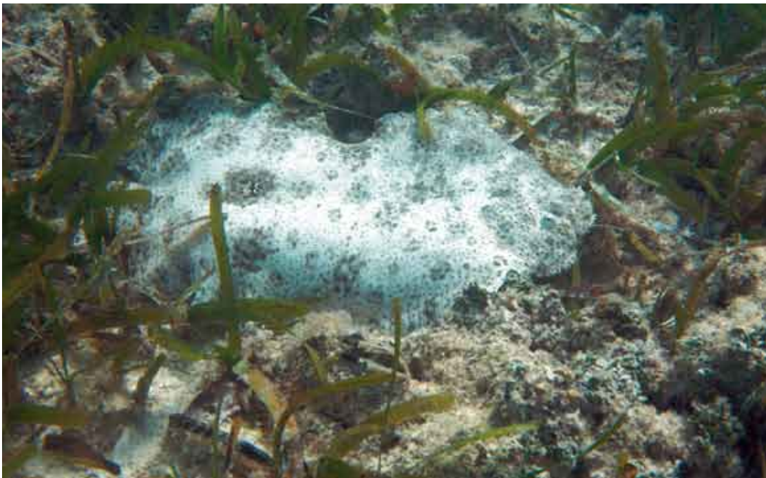
Flatfish in seagrass, Cymodocea rotundata and Thalassia hemprichii, behind the reef flat of a fringing reef of hard substrate mixed with sand, Tanga, Tanzania.

This paper presents an overview of seagrasses, the impacts of climate change and other threats to seagrass habitats, as well as tools and strategies for managers to help support seagrass resilience.