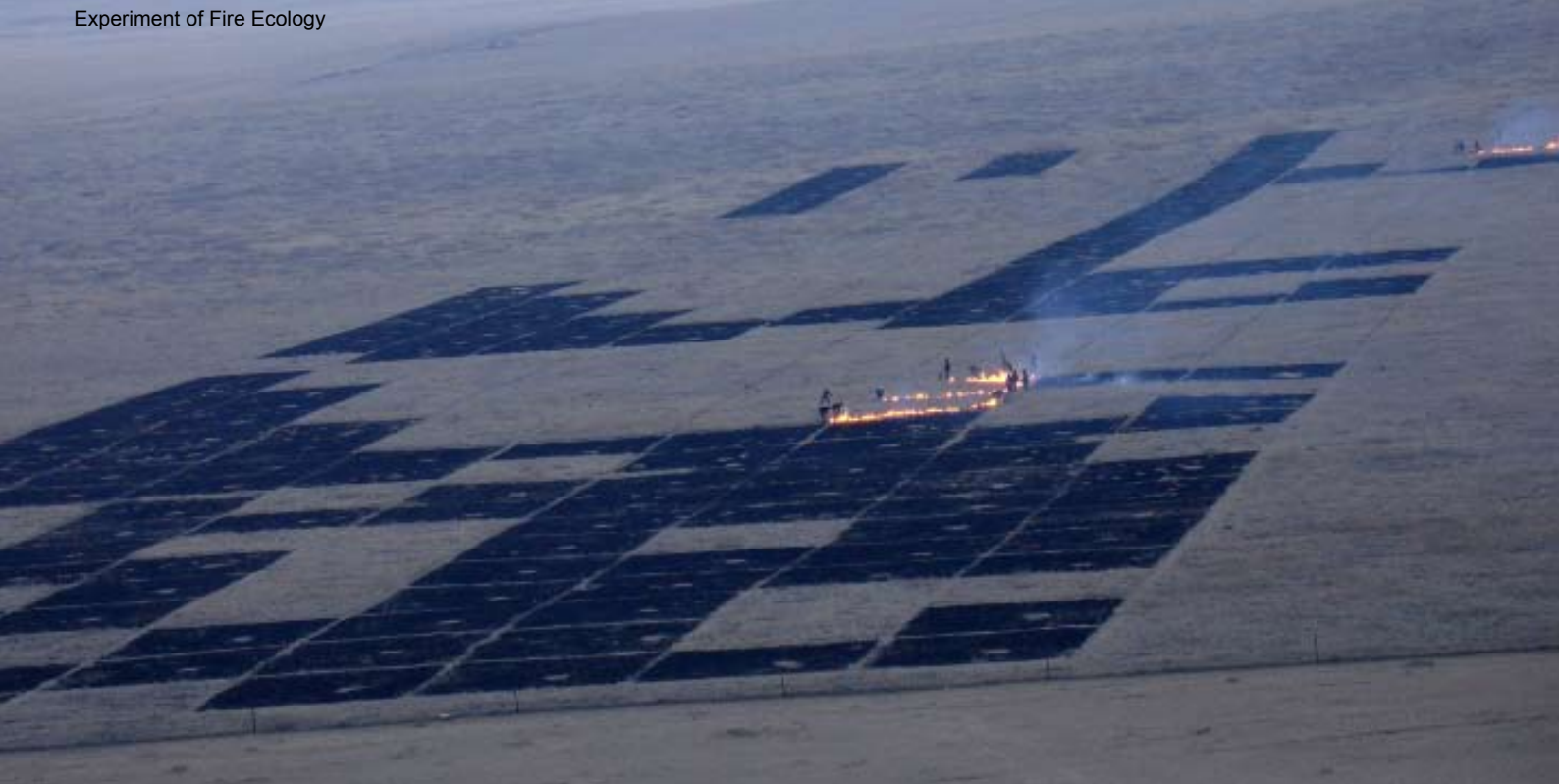
Experiment of Fire Ecology