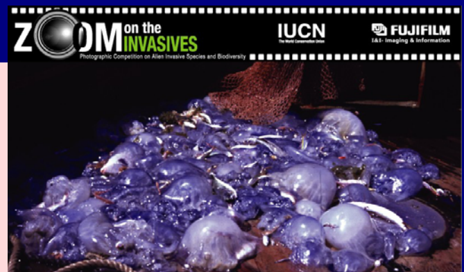
One of the prize winning photographs from the “Zoom on the Invasives” photo competition. Alien jellyfish, Rhopilema nomadica , wreaks havoc for Mediterranean coastal fisheries. Photo: Bella Galil, Israel

Invasions are less likely to be accurately recorded and monitored in marine, as opposed to terrestrial, environments. Increased baseline and monitoring surveys, and more detailed and quantitative risk assessment methodologies were identified as key priorities. In order to build capacity to identify and mitigate AIS, there were also calls for the development of regional marine IAS networks, greater cooperation and sharing of resources, and increased involvement with all stakeholders, including the private sector.