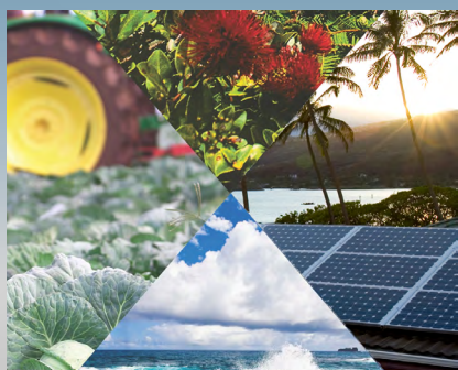
HGG Pinewheel

Hawai'i Green growth (HGG) is an innovative public-private partnership that coordinates across government, the private sector, and civil society to achieve Hawai'i's 2030 statewide sustainability goals and serve as a model for integrated green growth. Hawai'i Green Growth convenes diverse partners to identify areas for joint actions, including shared measures, policy priorities, innovative finance mechanisms, and concrete projects to drive implementation on Hawai'i's 2030 goals.