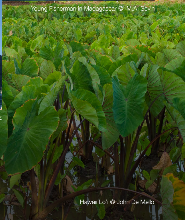
Hawaii Lo'i