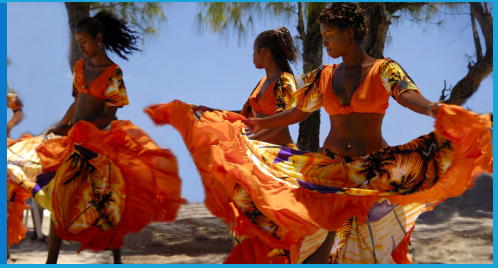
Traditional dancers from the Indianocean