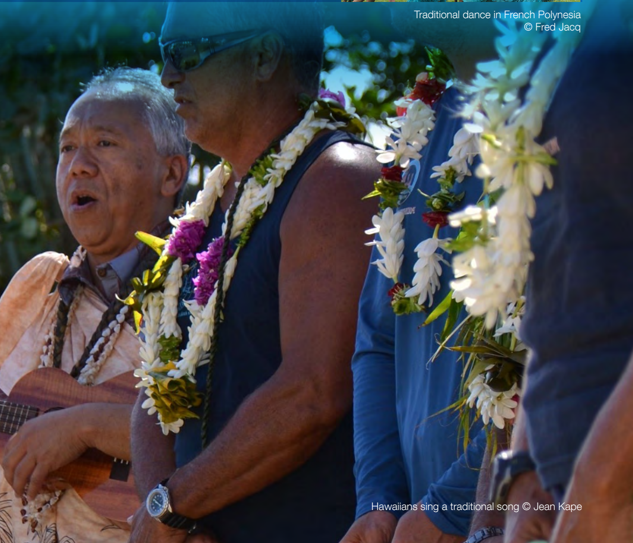
Hawaiians sing a traditional song