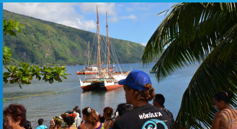
Arrival of Hawaiian pirogues (accompanied by Tahitian pirogue Faafaite)