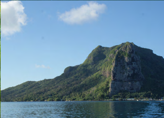
Maupiti, French Polynesia