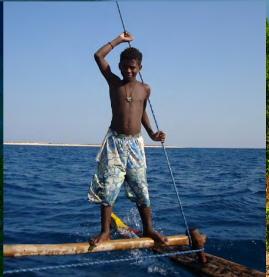
Young Fisherman in Madagascar

We invite you to meet colleagues, both old and new, who are on a similar island journey to sustainability at the 2016 IUCN World Conservation Congress.