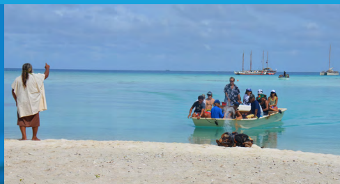
Punua welcomes the crews of Hokule'a and Hikianalia on its marae