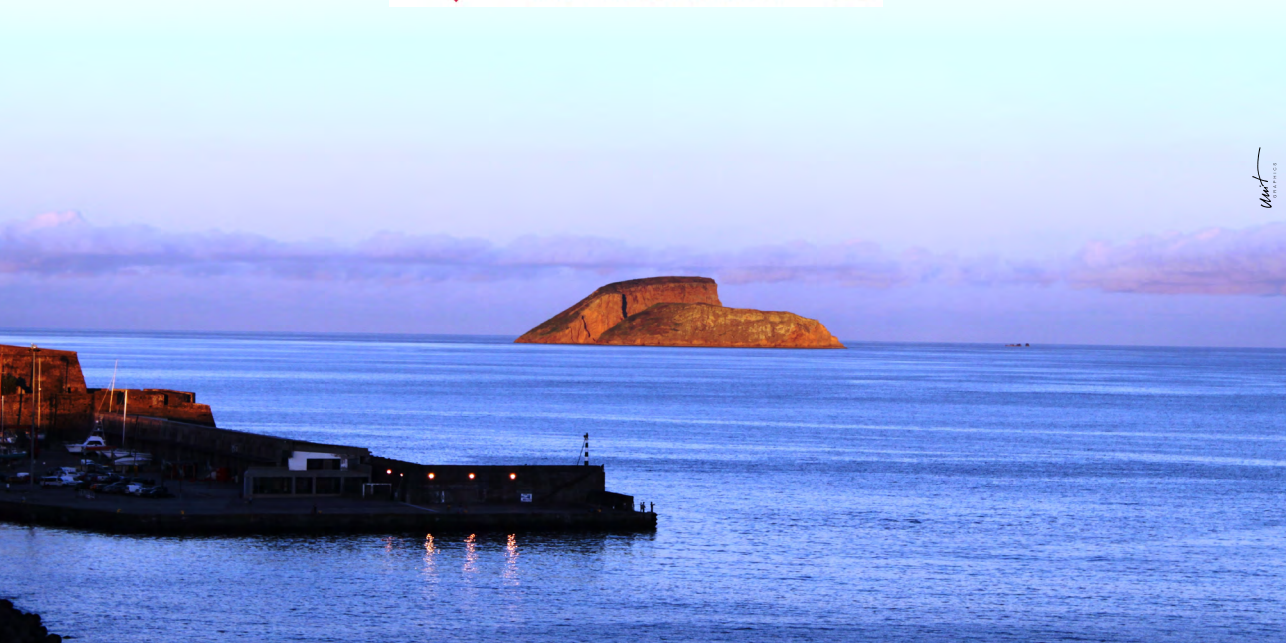
Sunset light on Ilhéus das Cabras natural reserve - Terceira island - Azores