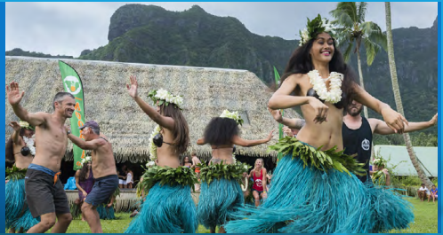
Traditional dance in French Polynesia