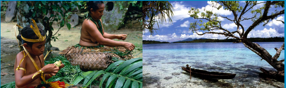
Federated States of Micronesia, Woman and girl weaving Areca palm leaves