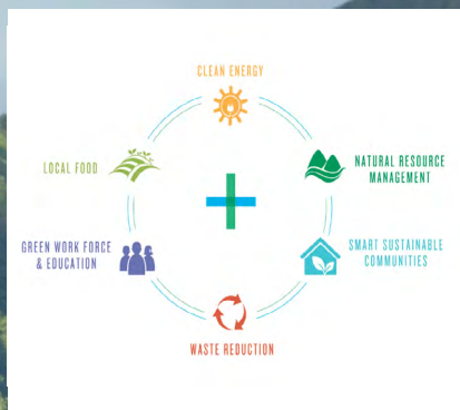
Aloha+ Challenge

Launched in 2014, the Aloha+ Challenge is a statewide sustainability commitment for the State of Hawai'i by the Governor, four County Mayors, Office of Hawaiian Affairs, State Legislature, and over 100 public-private partners across the state.