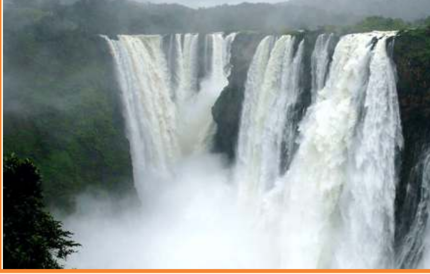
Jog Water Falls