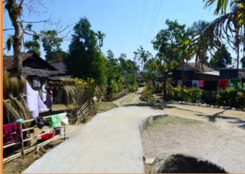
Mawlynnong Cleanest Village of Asia in Meghalaya, India