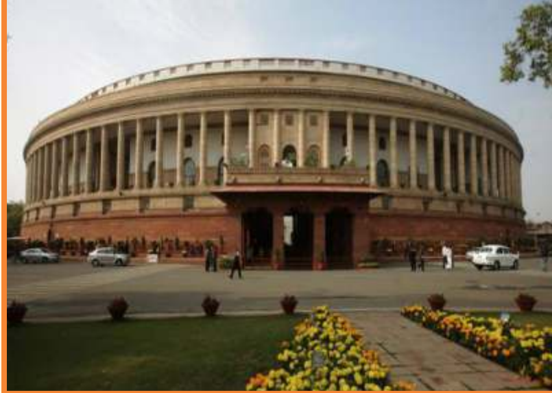
Parliament House, India