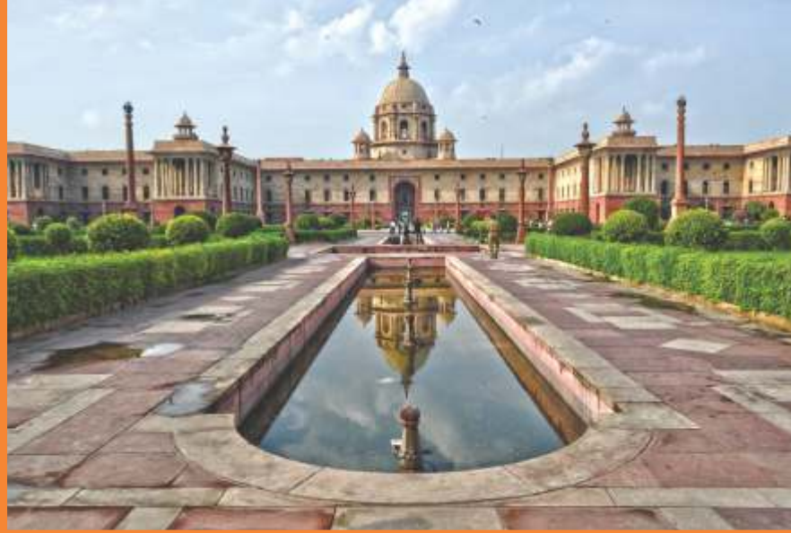
Rashtrapati Bhawan, New Delhi, India

The Ministry of Environment, Forest and Climate Change is the nodal agency for implementation of policies and programmes relating to conservation of the country's natural resources. The Ministry of Water Resources, River Development and Ganga Rejuvenation and NMCG looks after the water resources of the country, including projects and plans for cleaning the country's rivers.