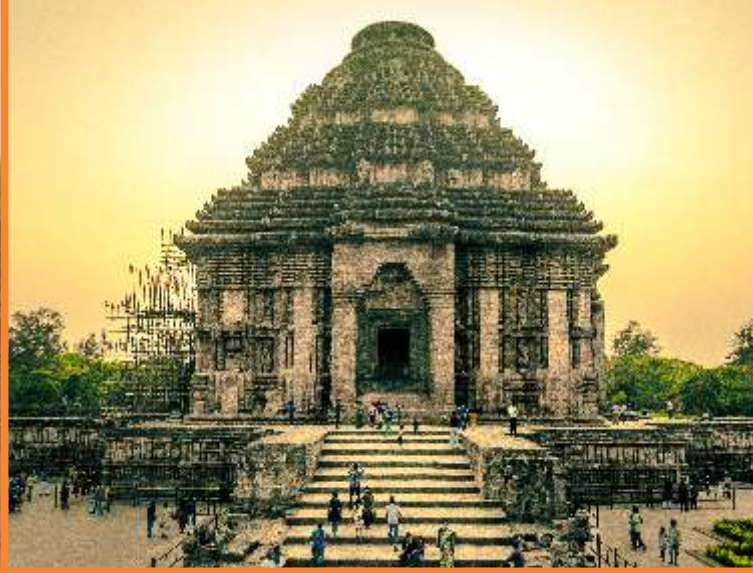
Sun Temple, Konark