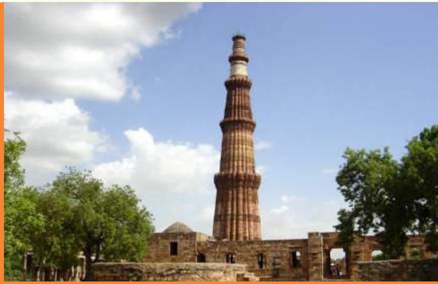
Qutub Minar, New Delhi

This Conference is designed to deal with the key issues shared by stakeholders' from all over the world with major environmental challenges, namely, raising awareness, information, integration, management of environmental resources, gearing towards innovative approaches to environmental remediation and restoration. The world is facing an extraordinary situation, in relation to the finite extent of all its natural resources and to find solutions, frame policies objectively and transparently which will be acceptable to all stakeholders at large, in protecting further degradation of natural resources.