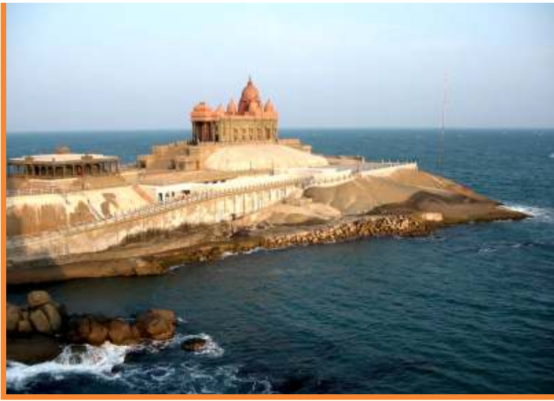
Vivekanand Rock, Kanyakumari