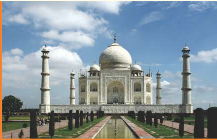
Taj Mahal, Agra, India